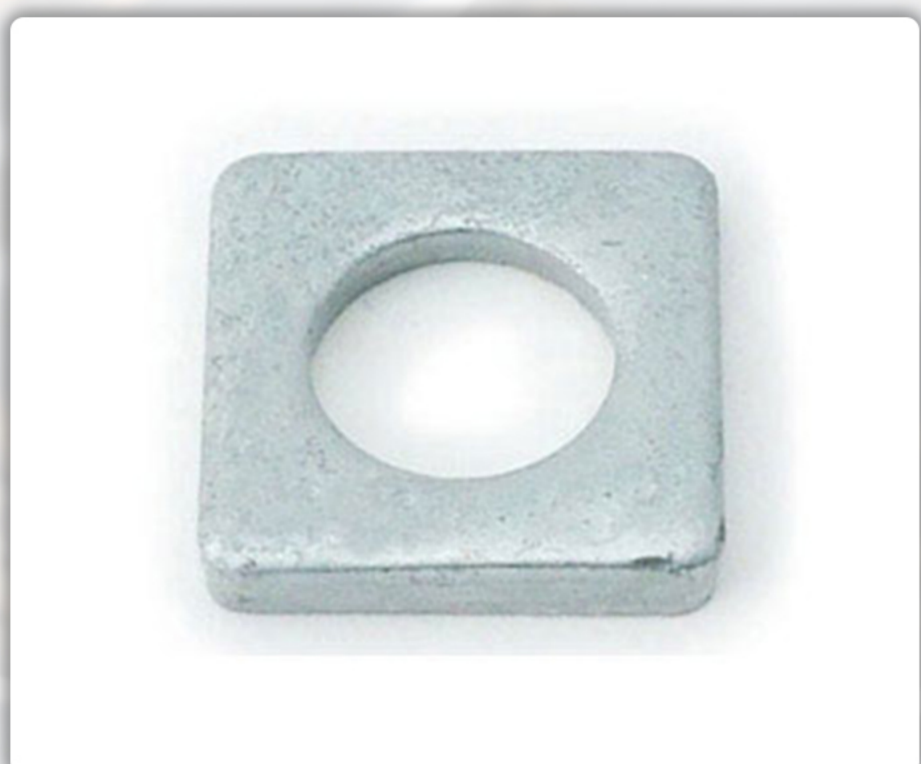
» TAPPER WASHERS