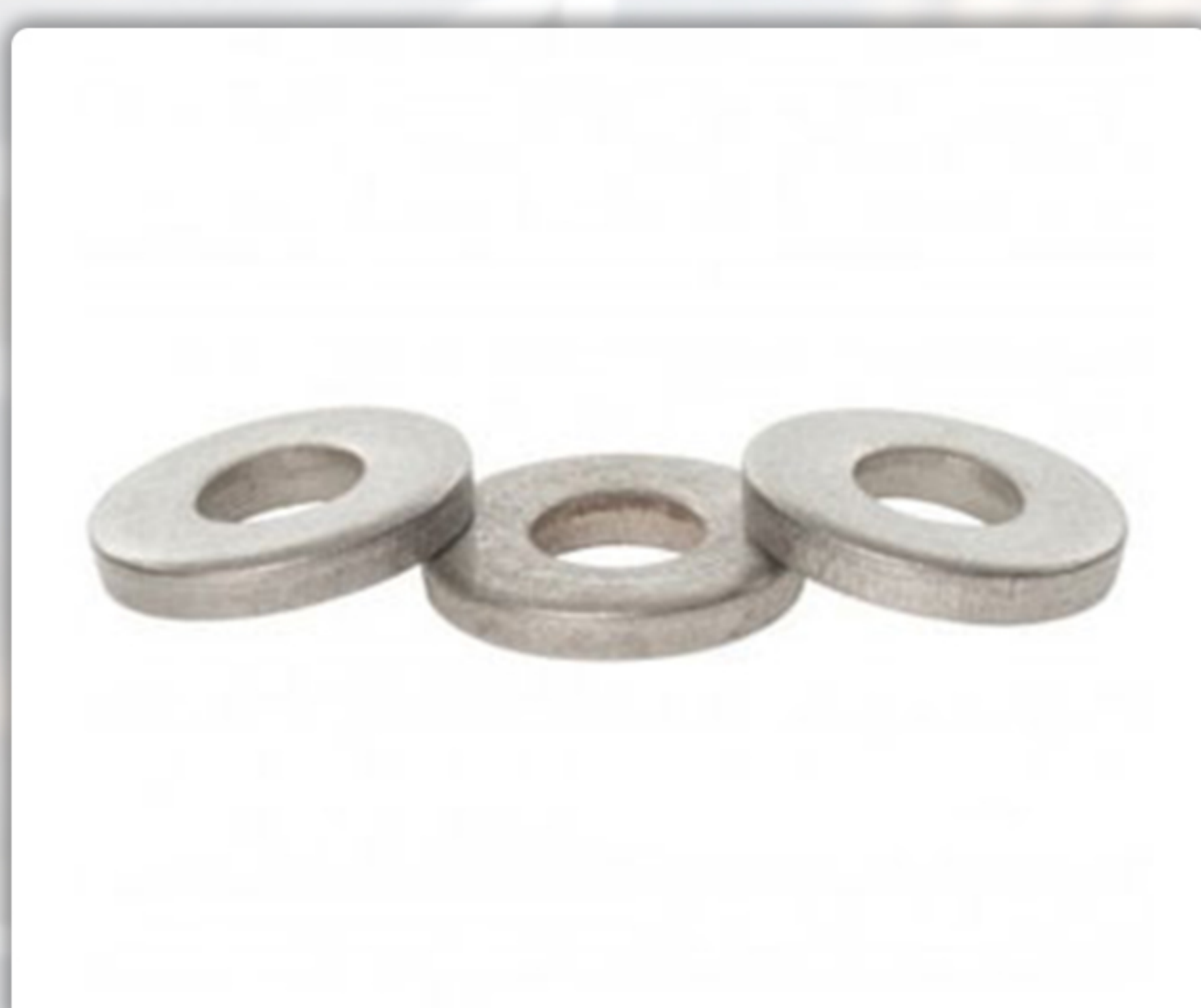
» PACK WASHERS