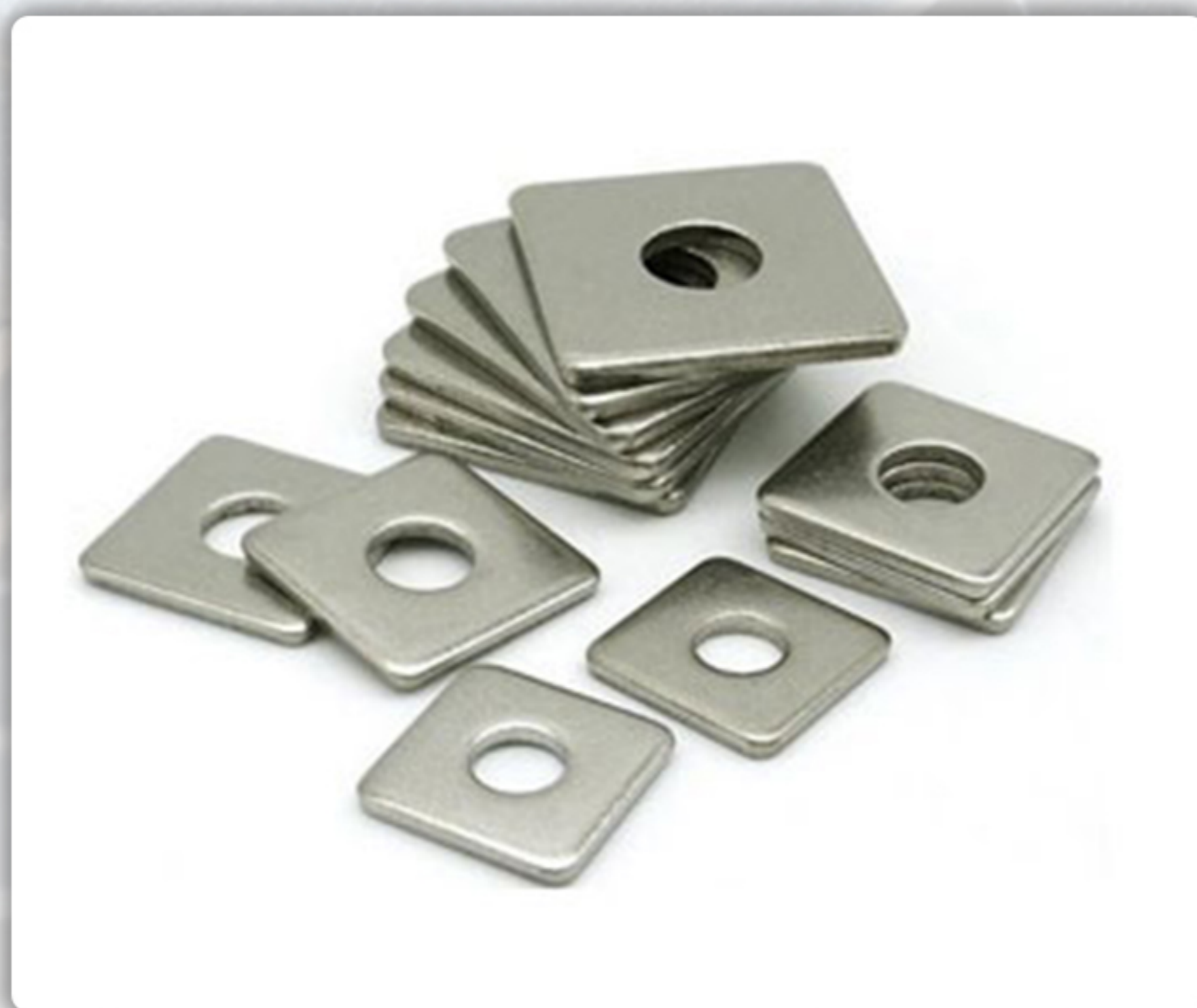
» SQUARE WASHERS