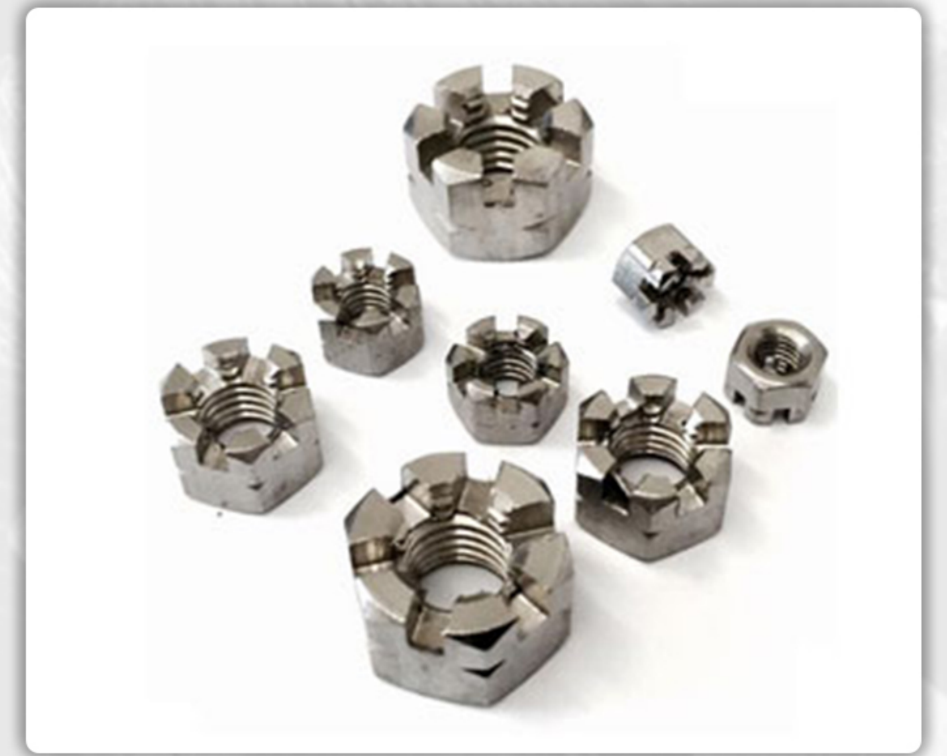
» SLOTTED NUTS