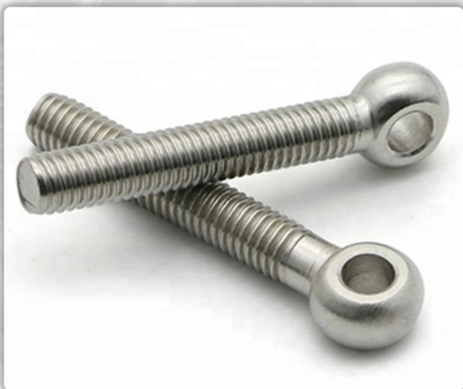
» EYE BOLTS