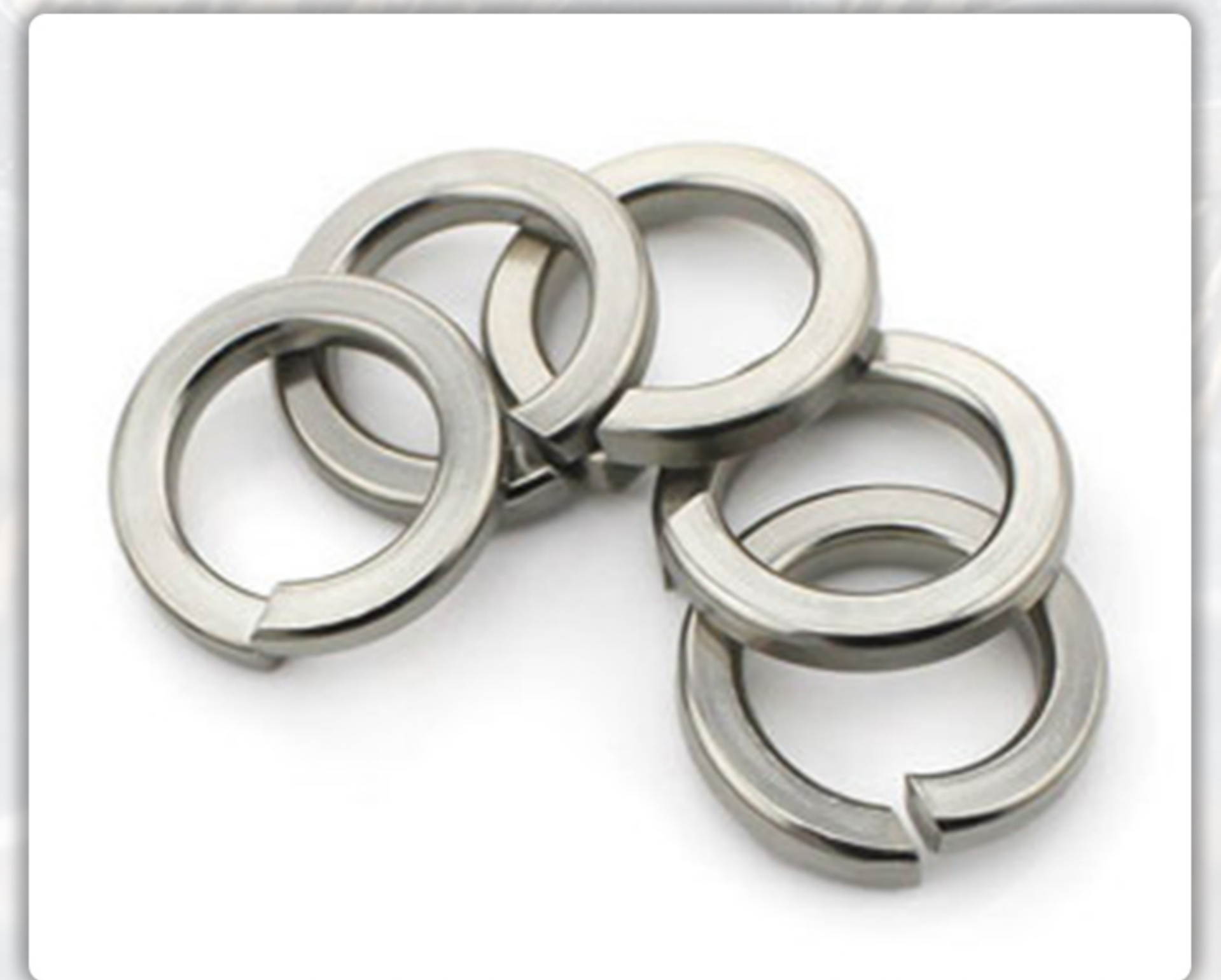
» SPRING WASHERS