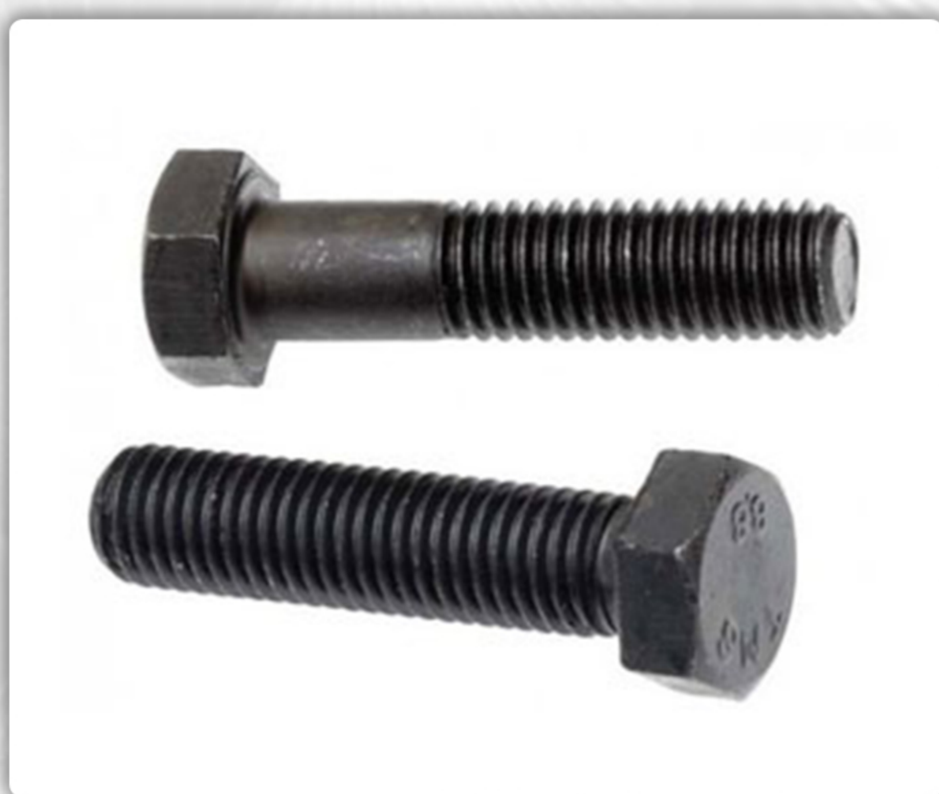
» HEX BOLTS