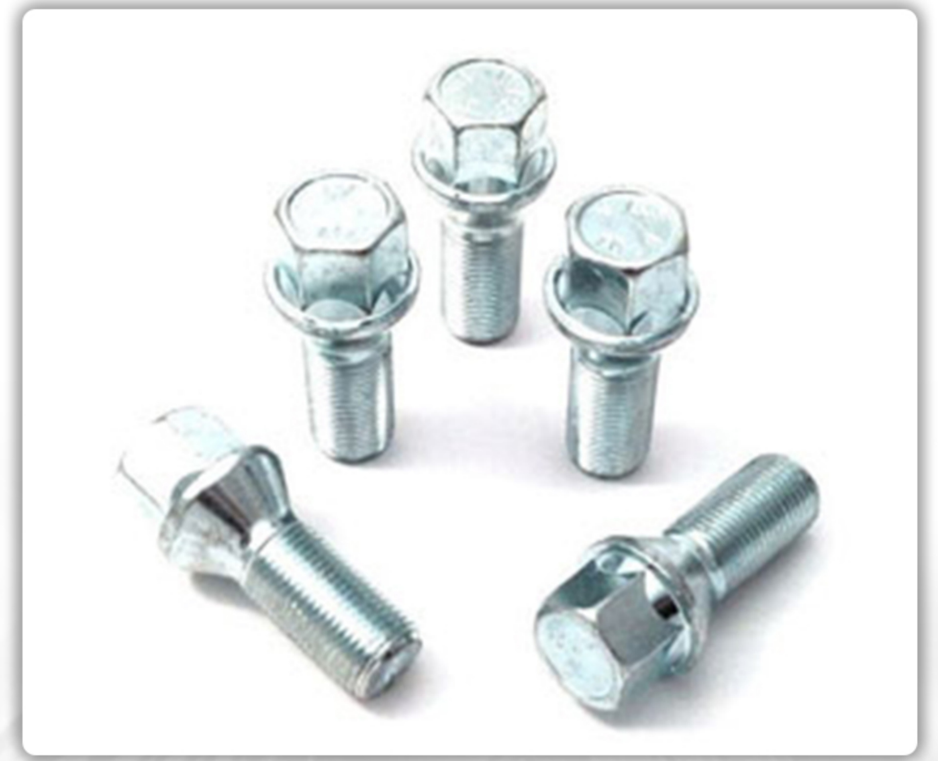
» WHEEL BOLTS