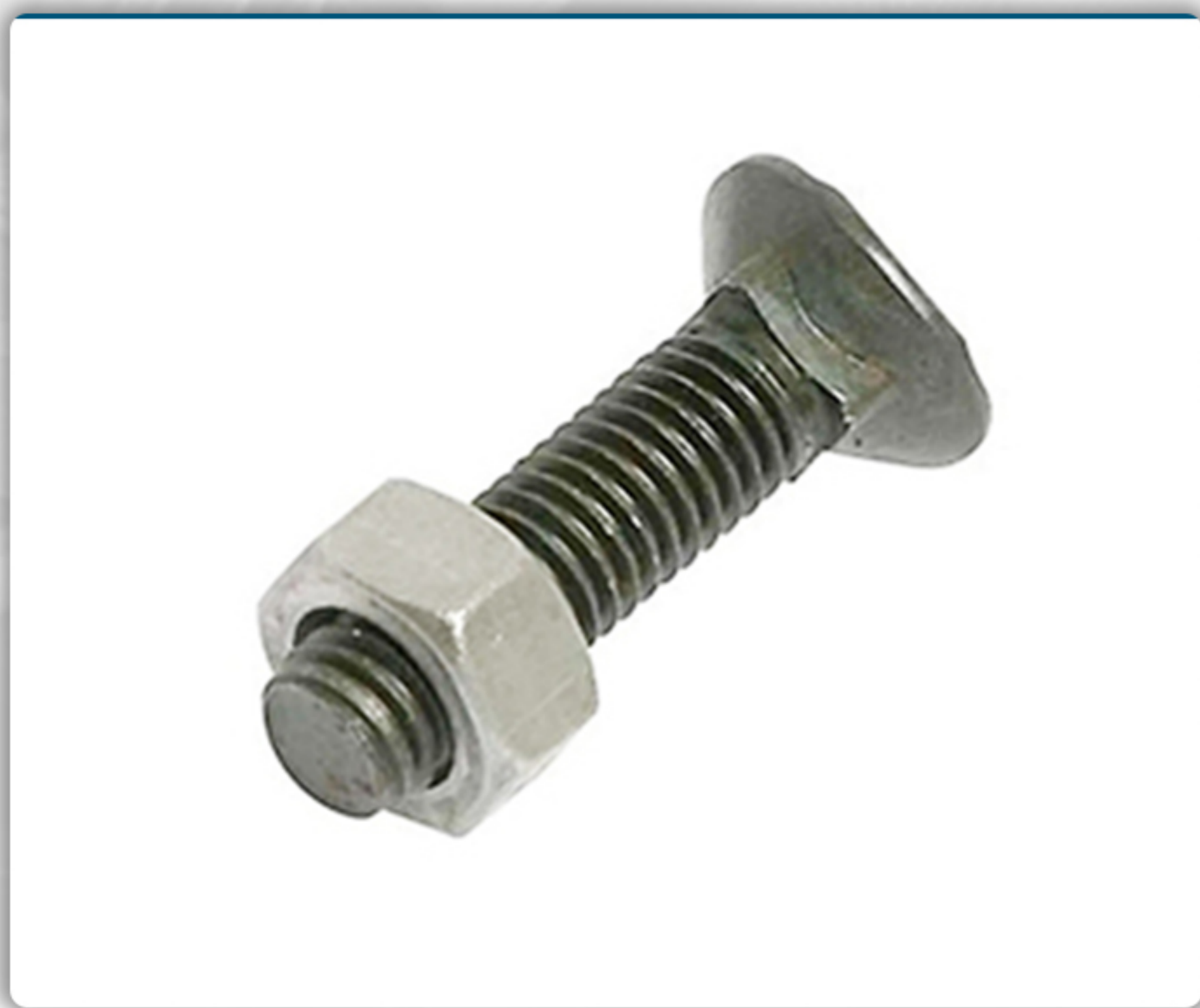
» FALLA BOLTS