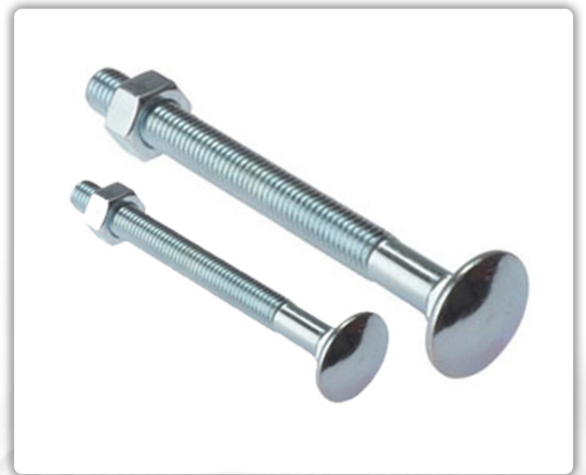
» CARRIAGE BOLTS