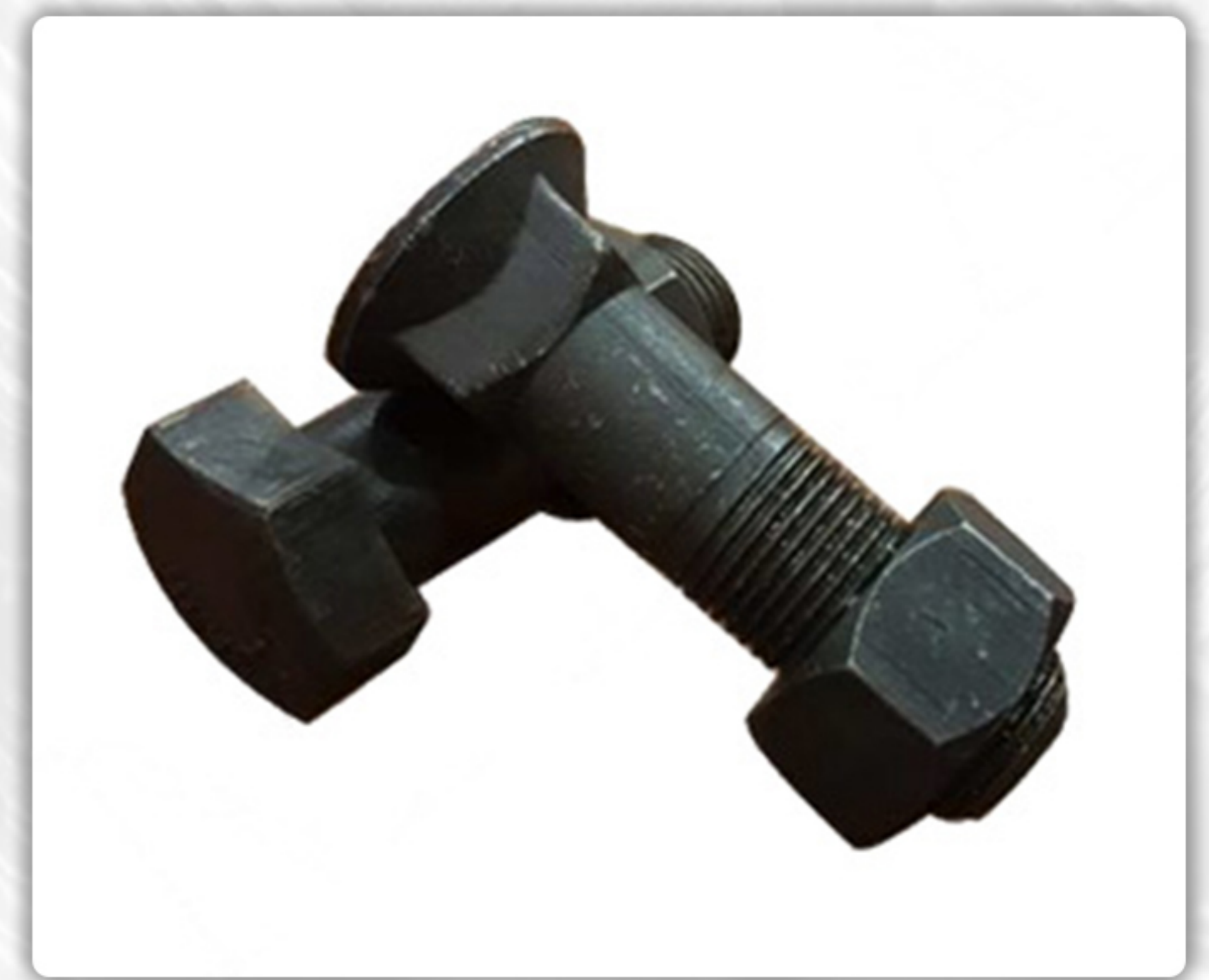
» TOOTH BOLTS