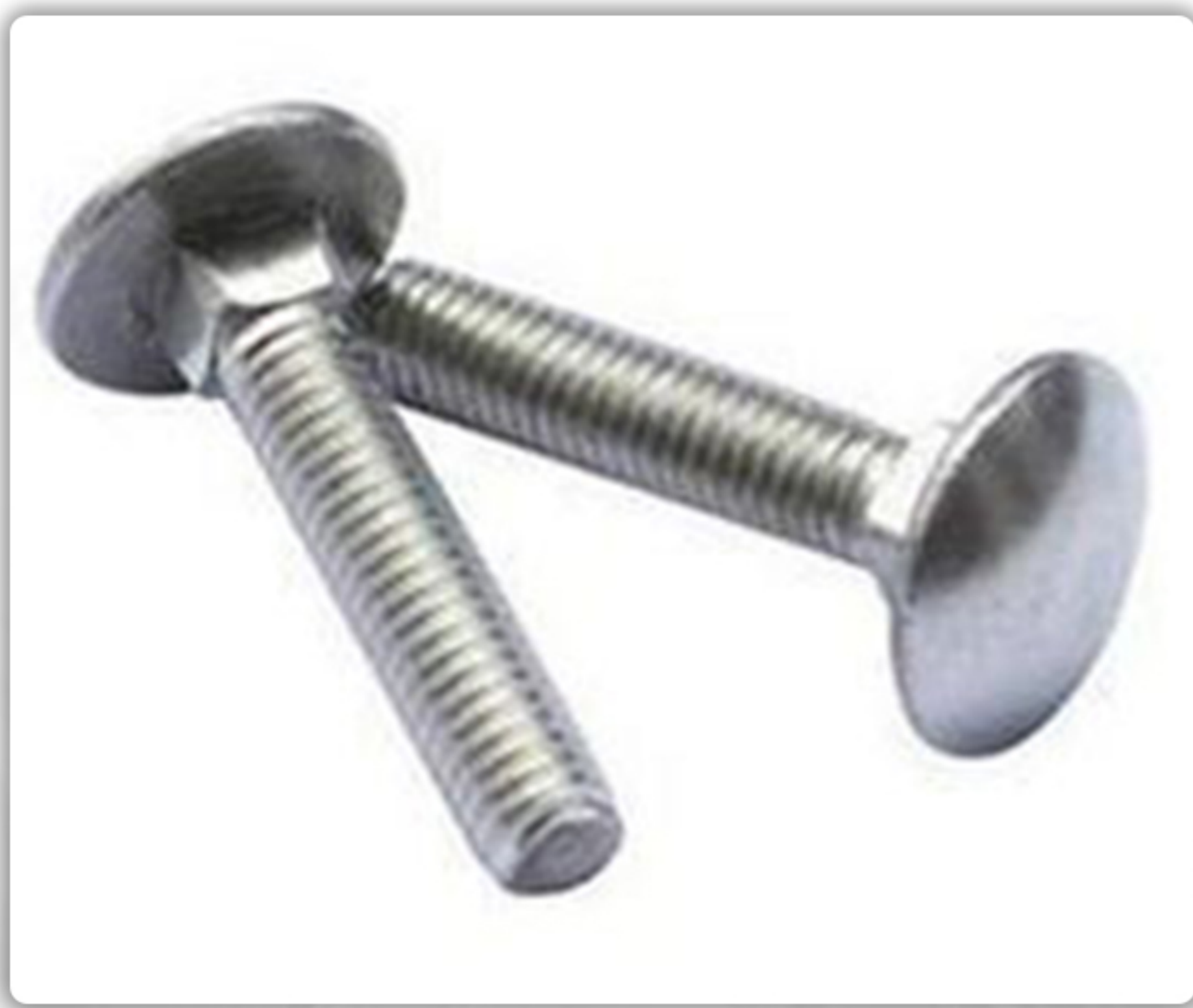
» ROUND BOLTS