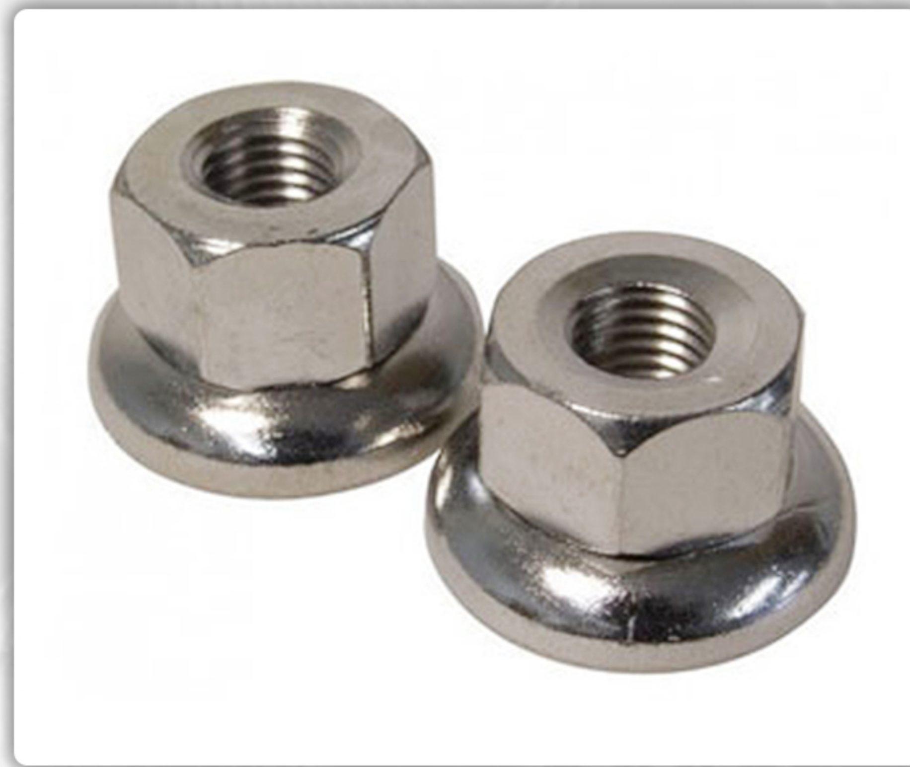
» WHEEL NUTS