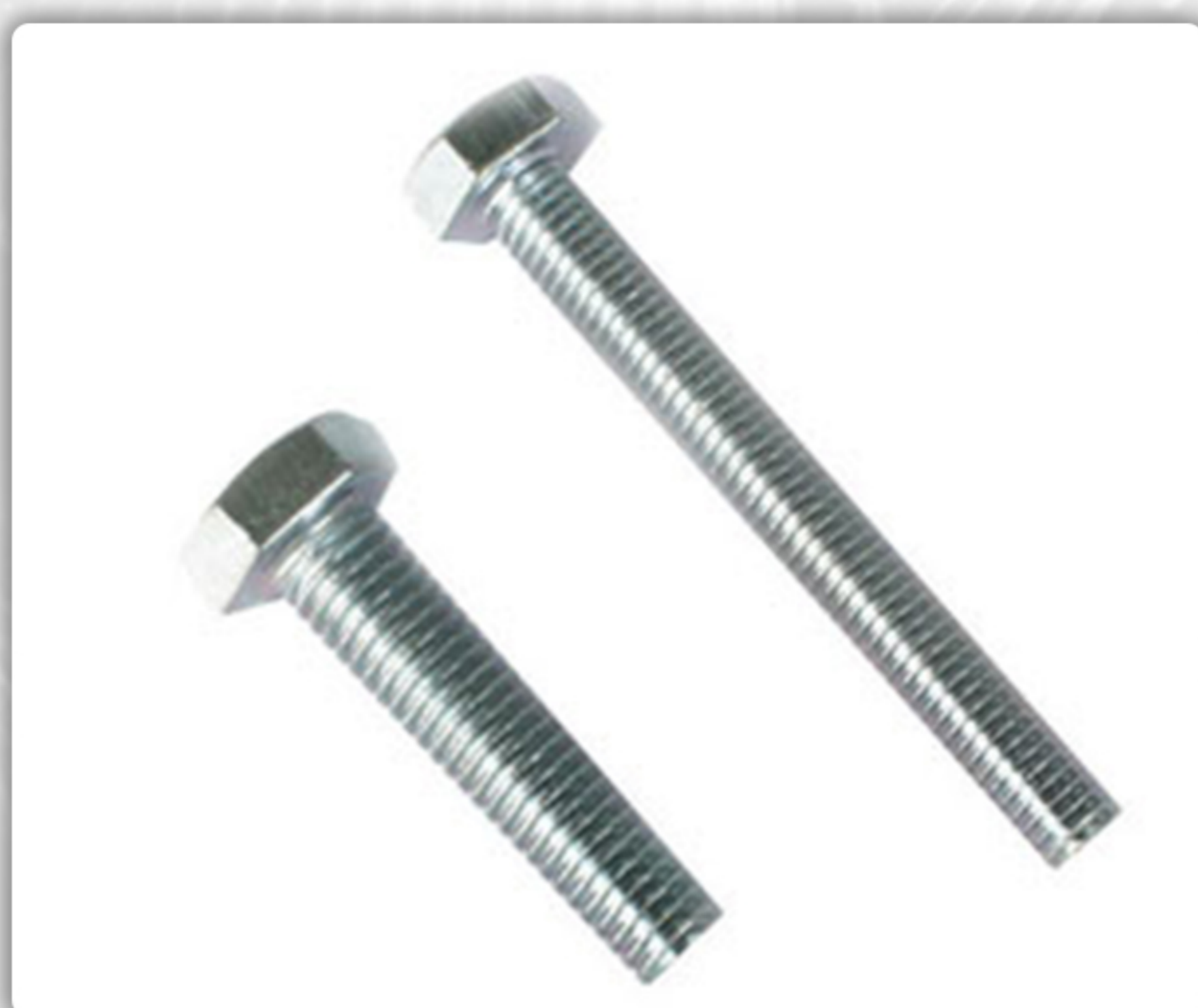
» FULL THREAD BOLTS