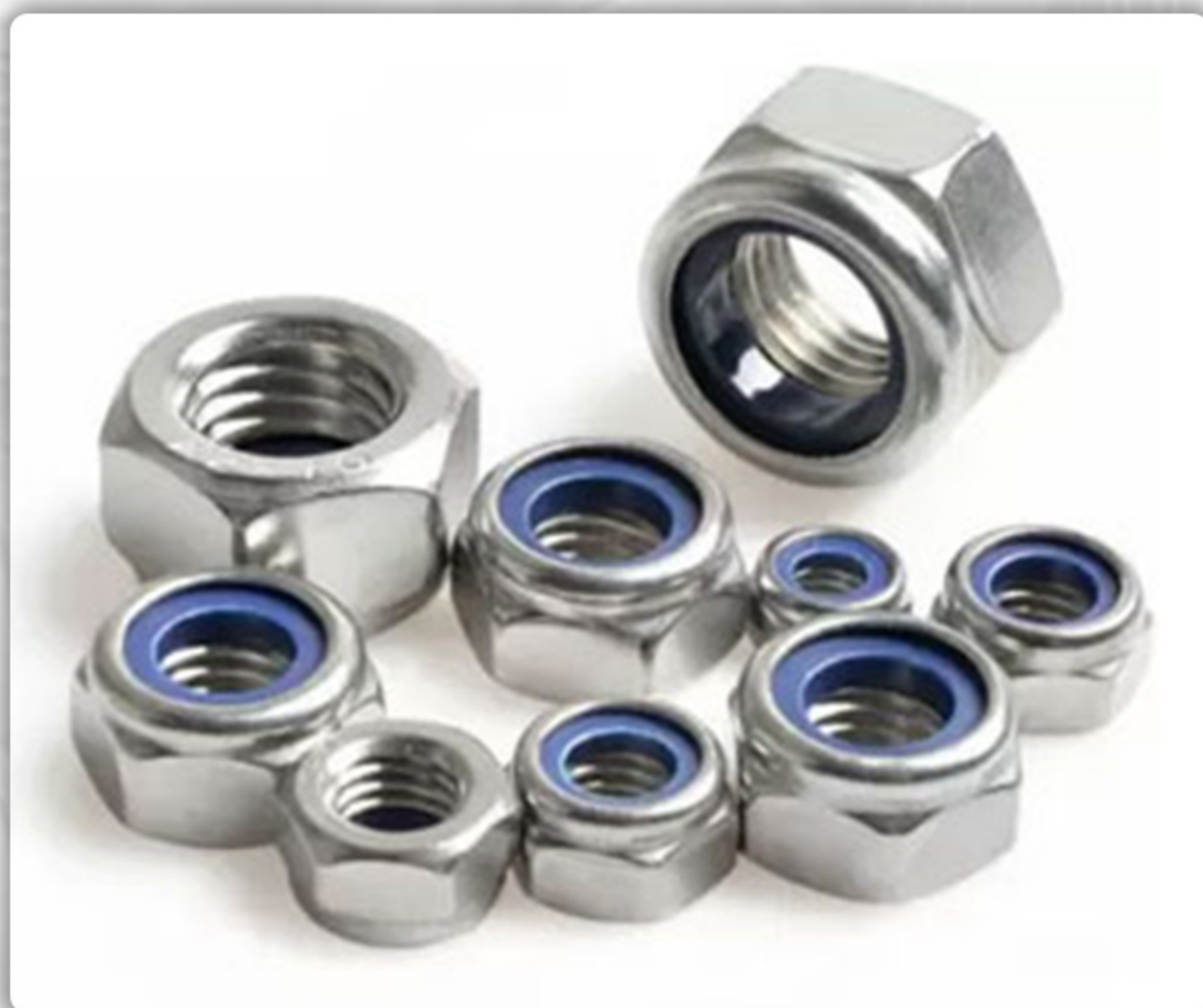
» NYLOCK NUTS