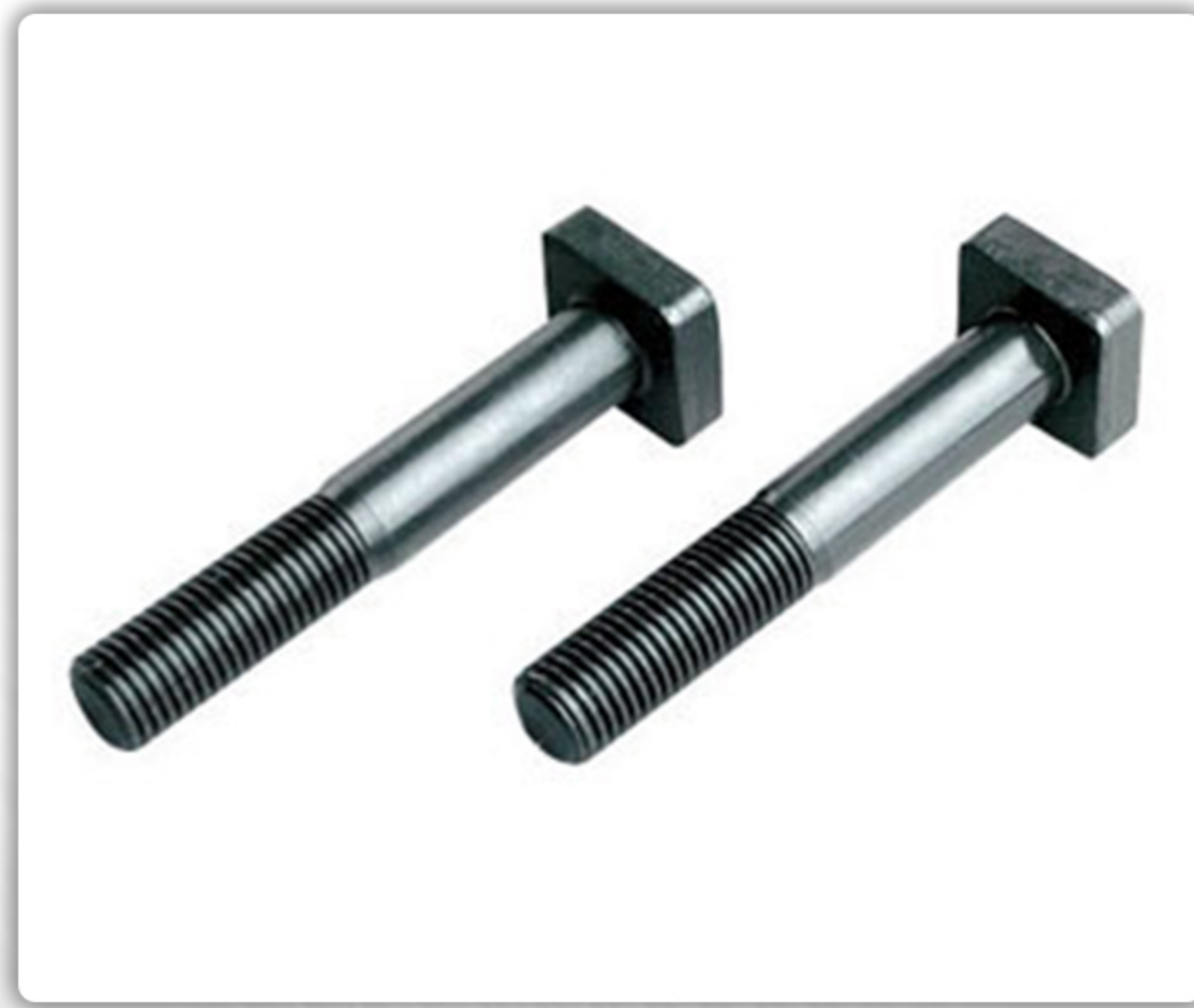
» SQUARE BOLTS