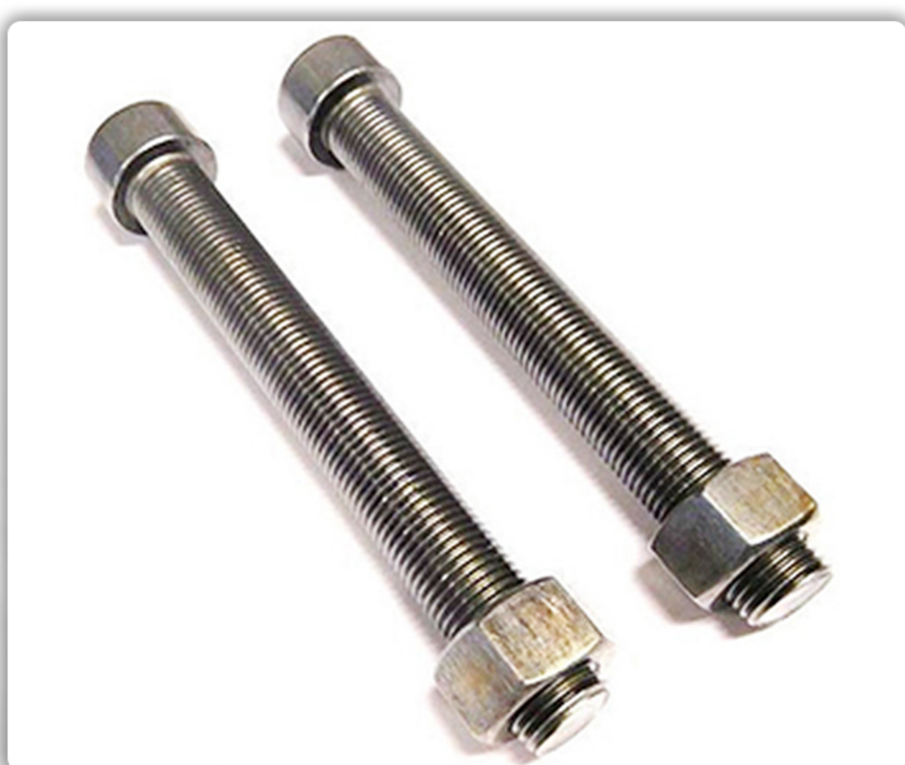
» CENTER BOLTS