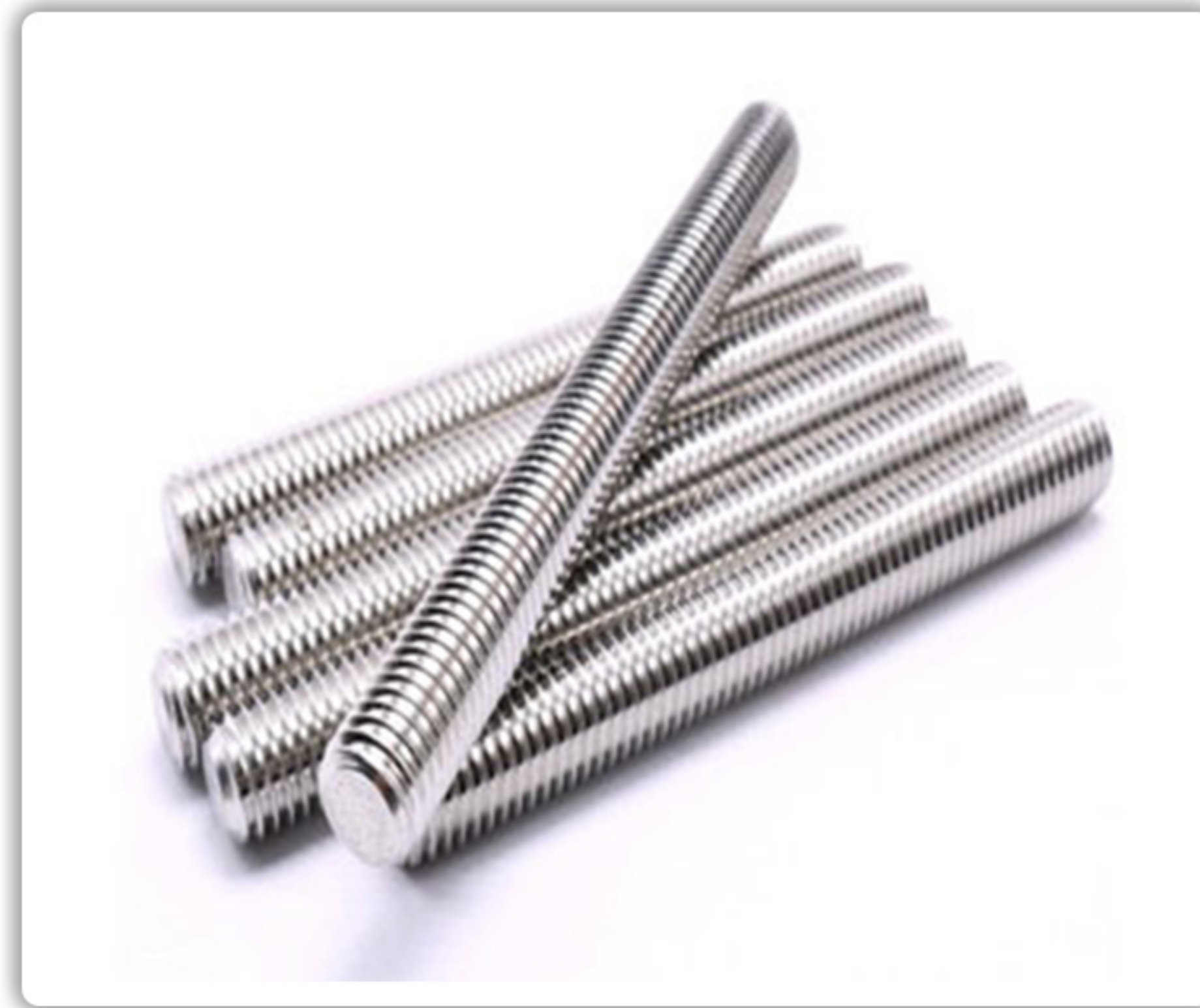
» THREAD RODS