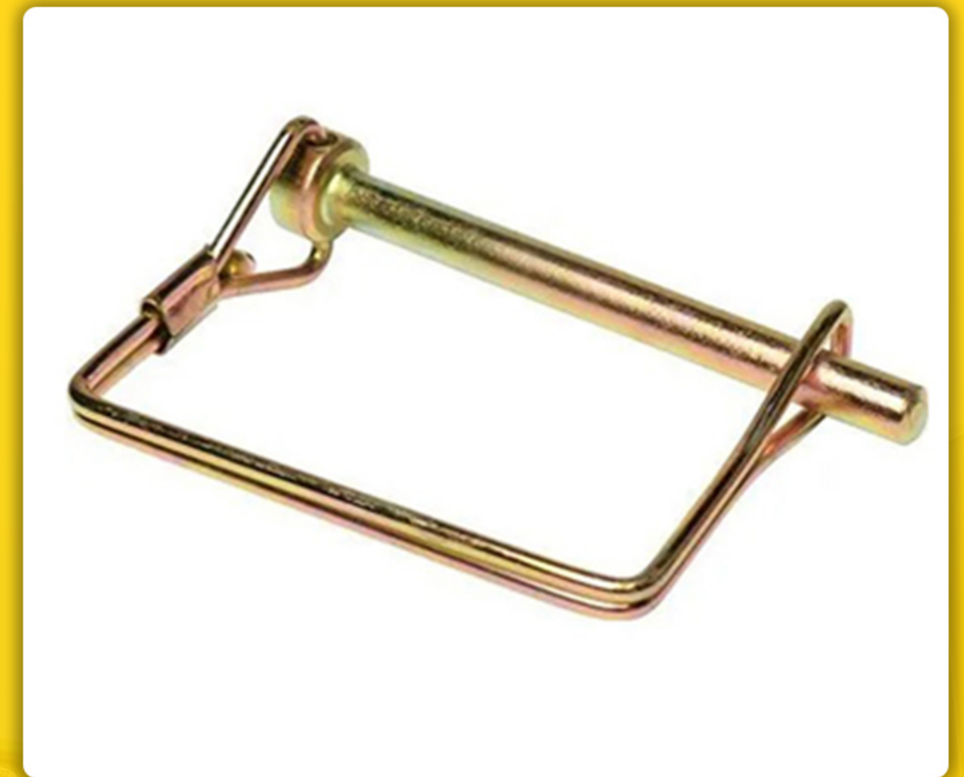
» SQUARE PTO PINS