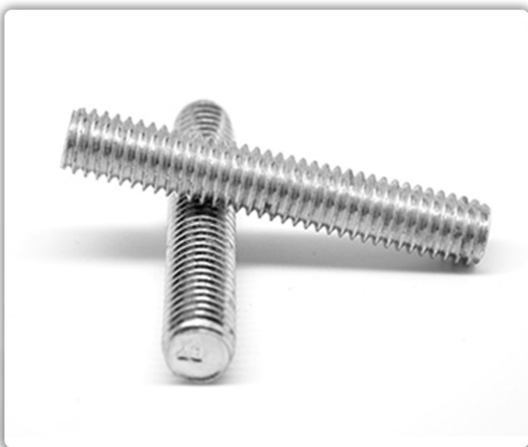
» THREADED BAR