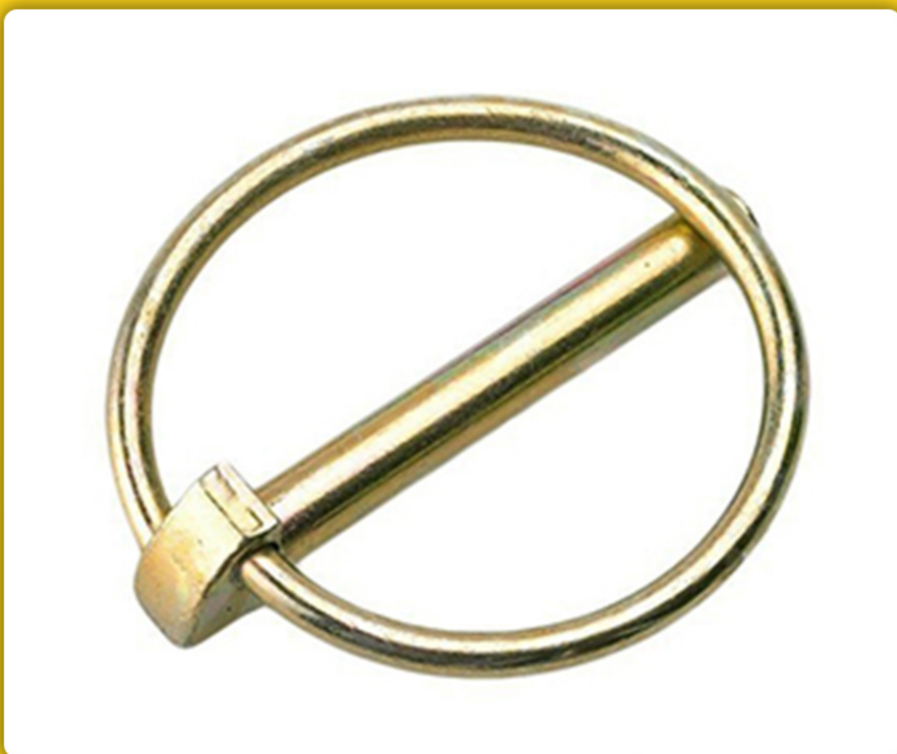
» LINCH PINS