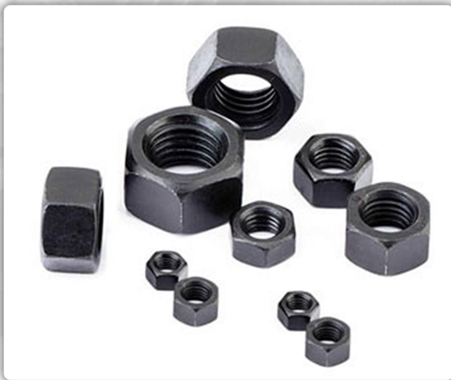
» HIGH TENSILE NUTS