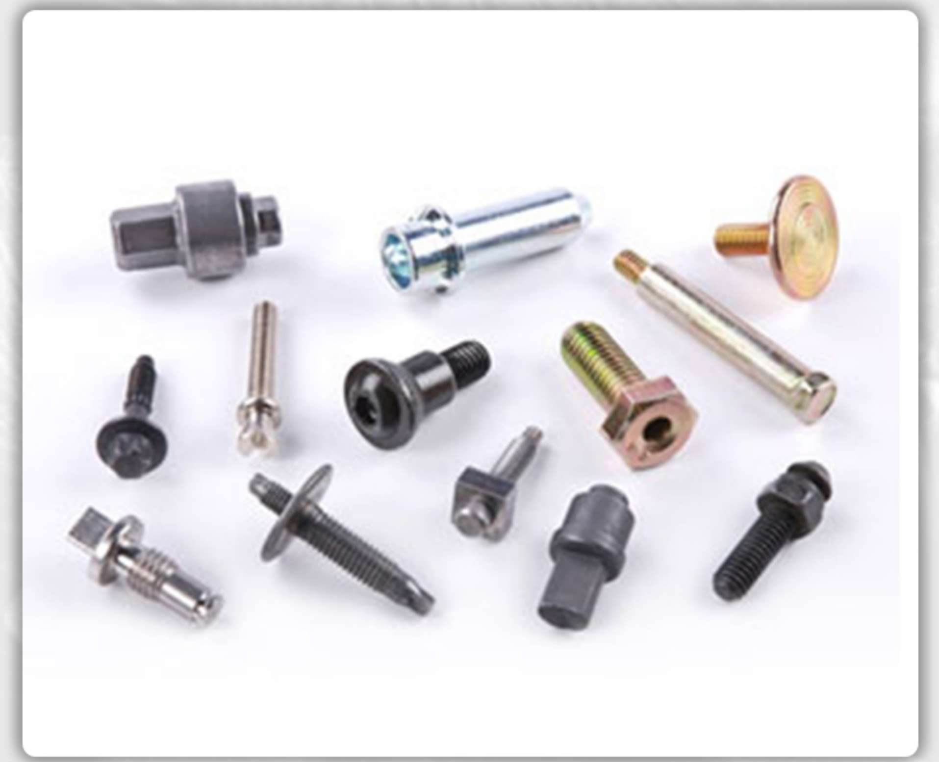
» SPECIAL BOLTS