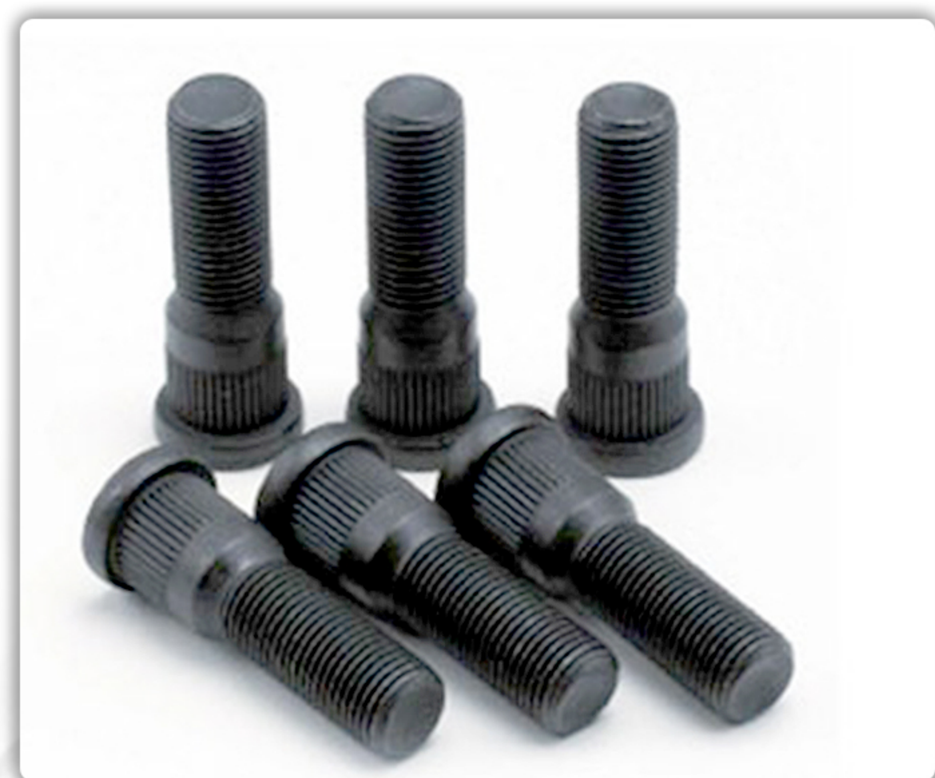
» HUB BOLTS