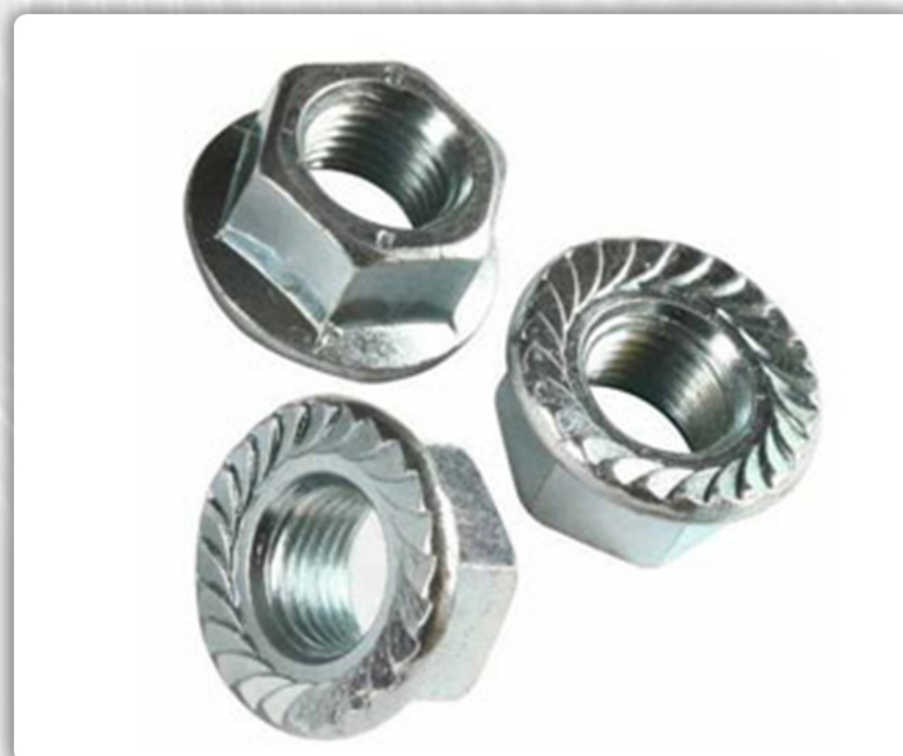
» FLANGE NUTS