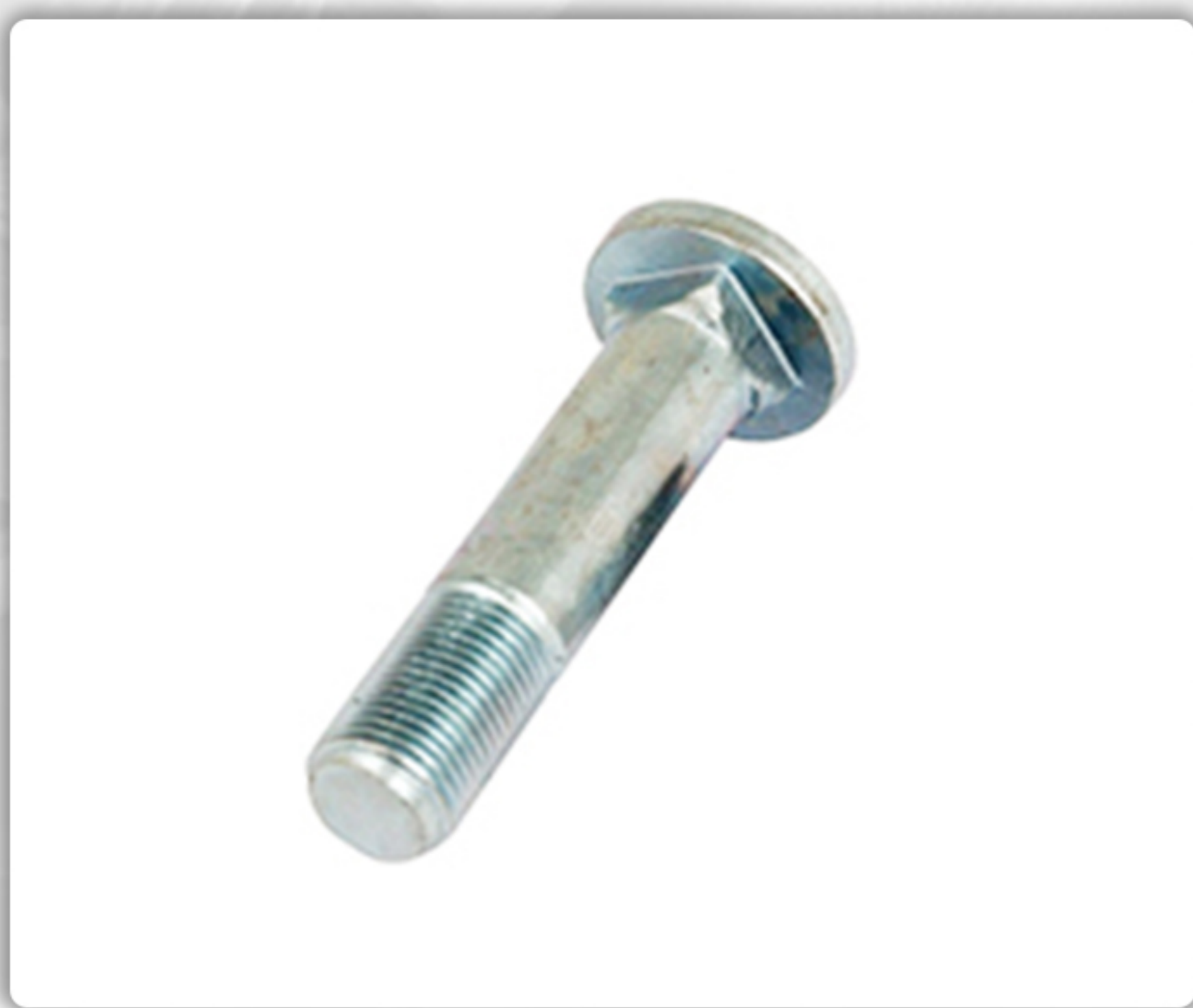
» RIM BOLTS