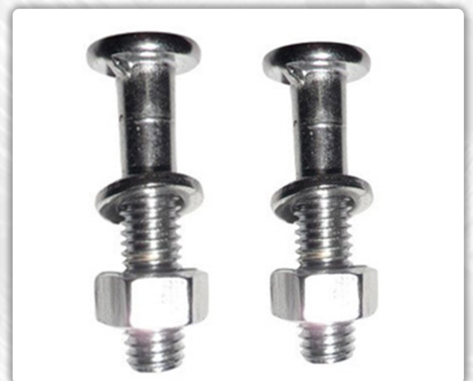
» SEAT BOLTS