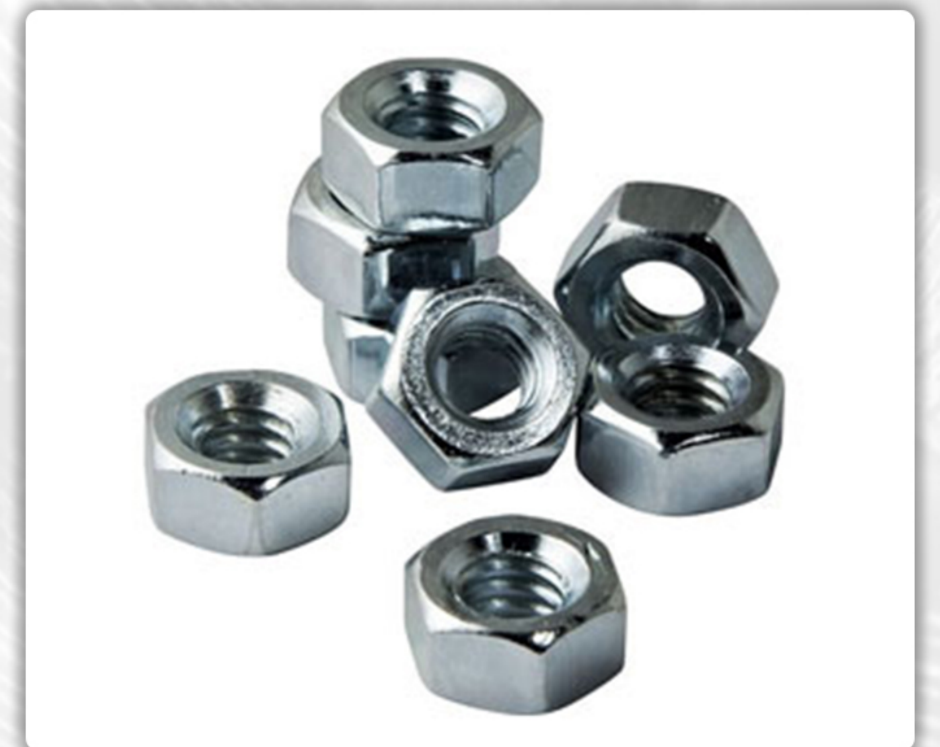
» HEX NUTS