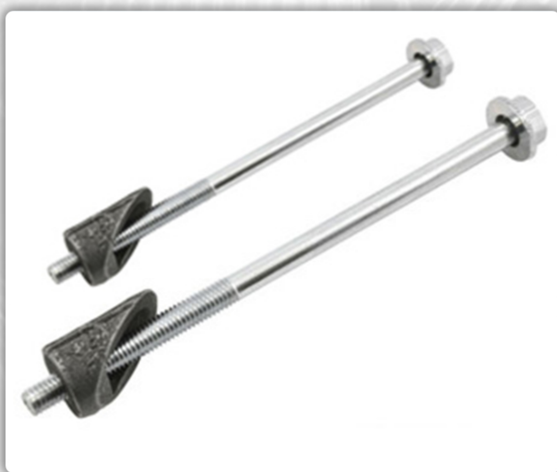
» EXPENDER BOLTS