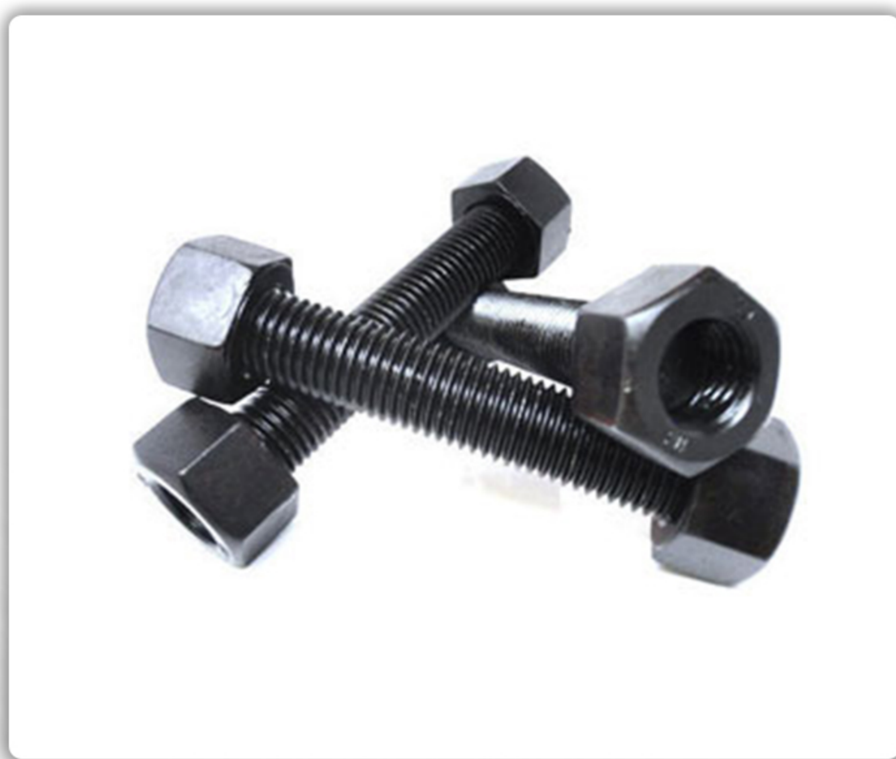
» STUD BOLTS