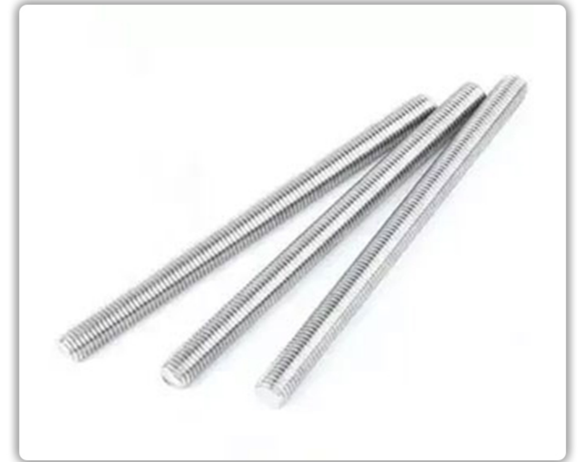
» LONG THREAD BARS