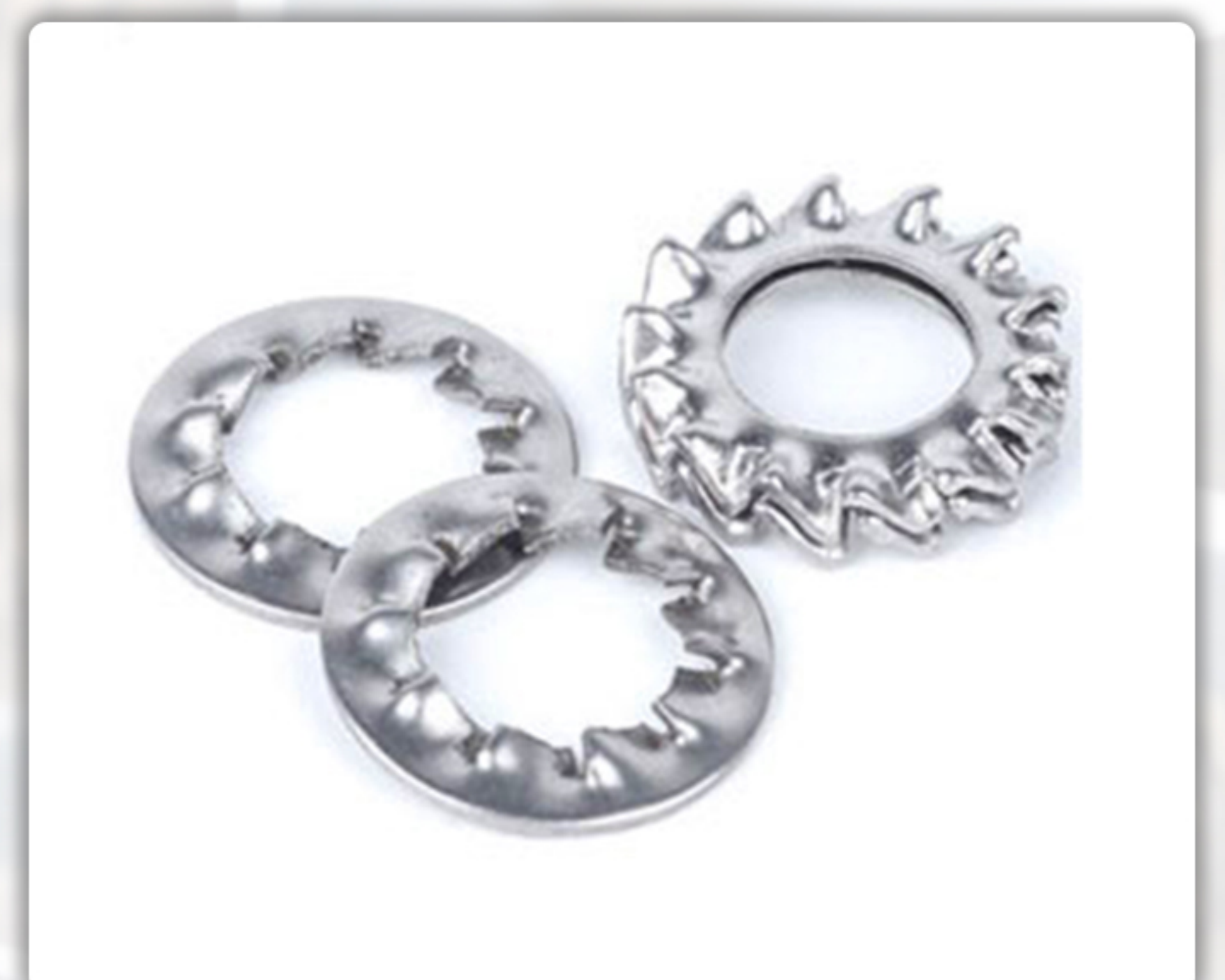
» STAR TAPPER WASHERS