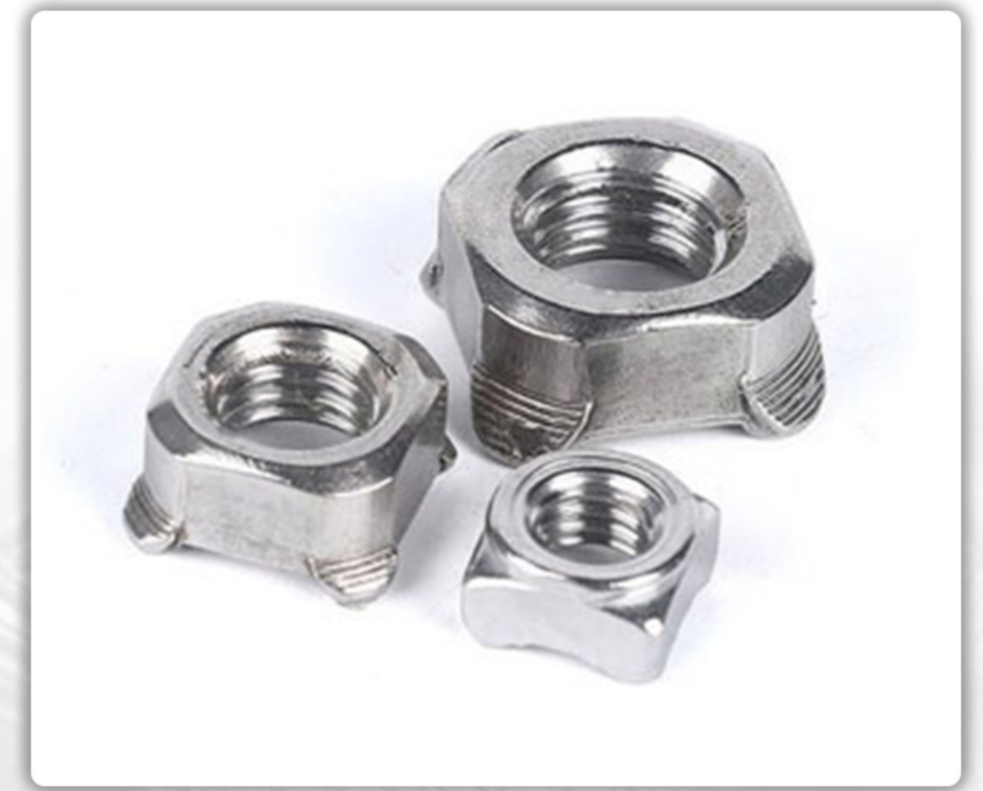
» SQAURE WELD NUTS