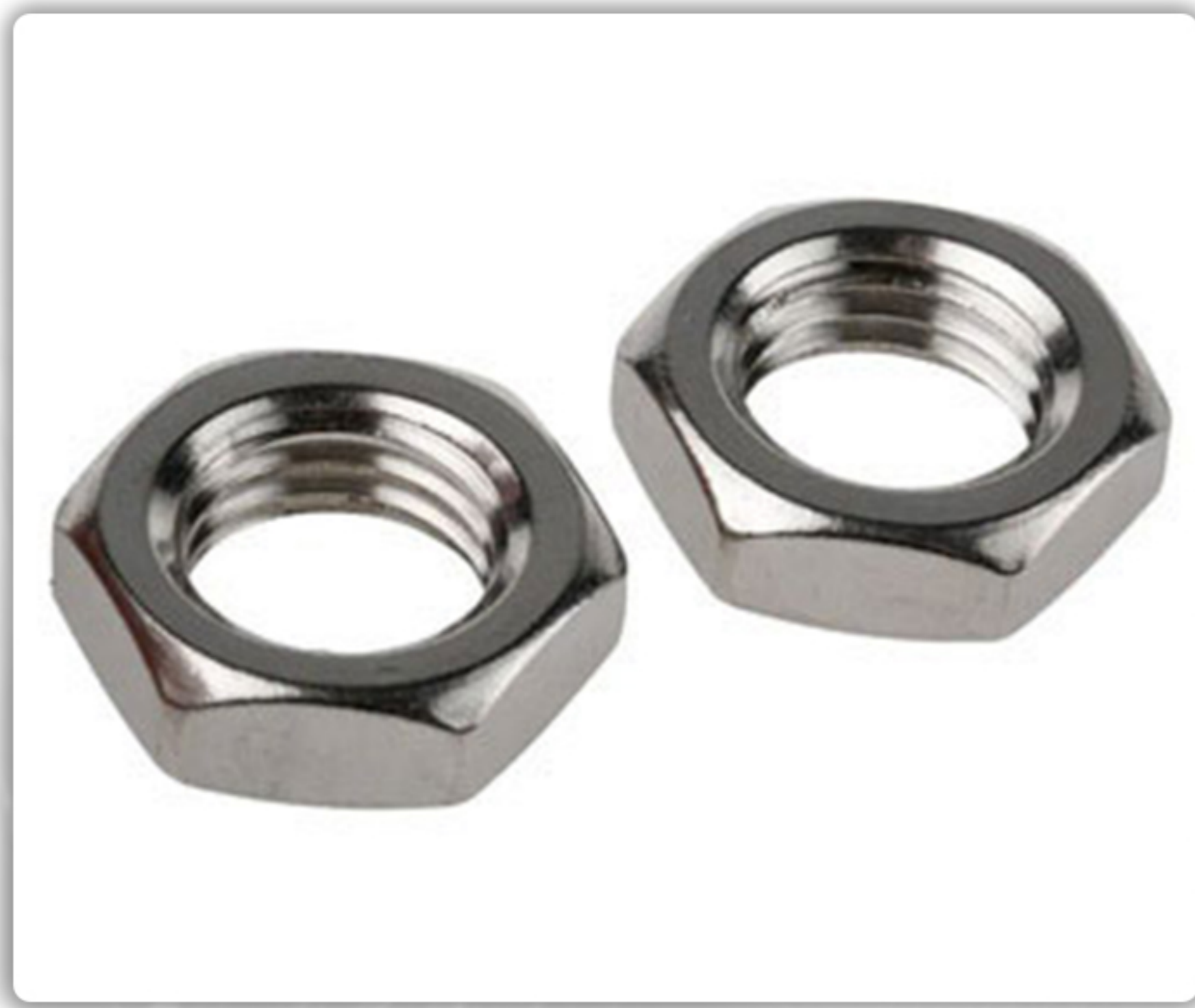
» PLAIN NUTS