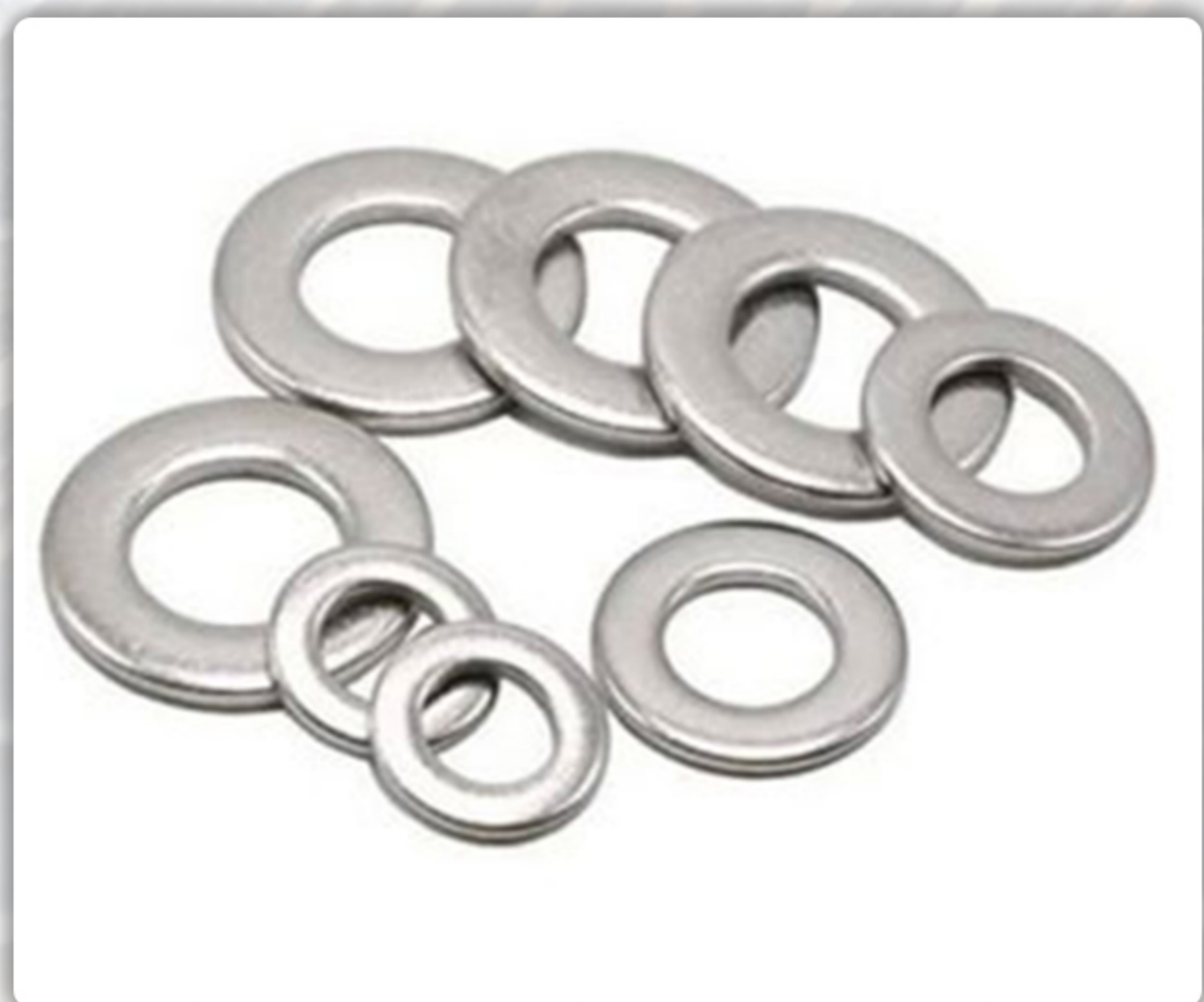
» PLAIN WASHERS