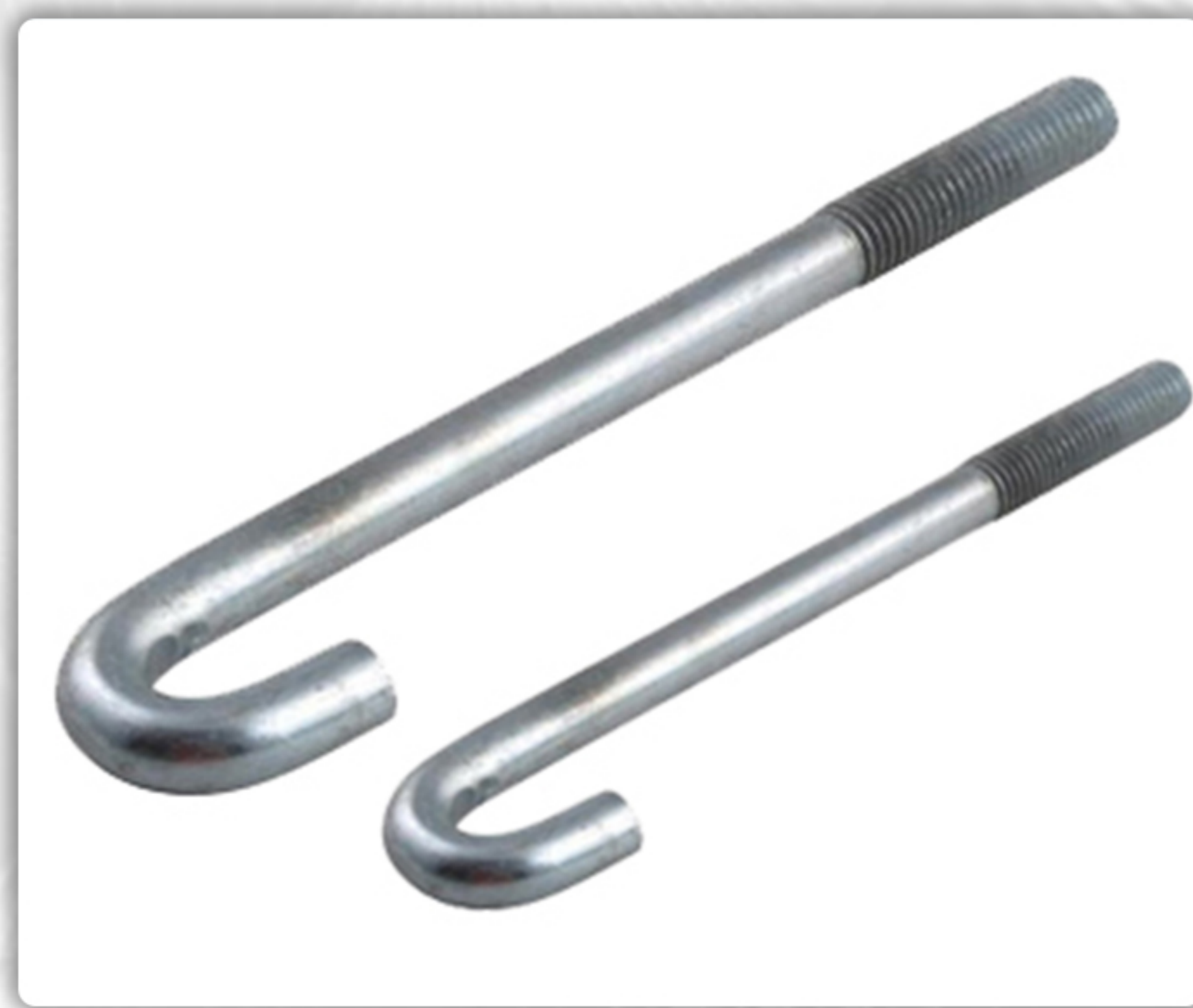
» J BOLTS