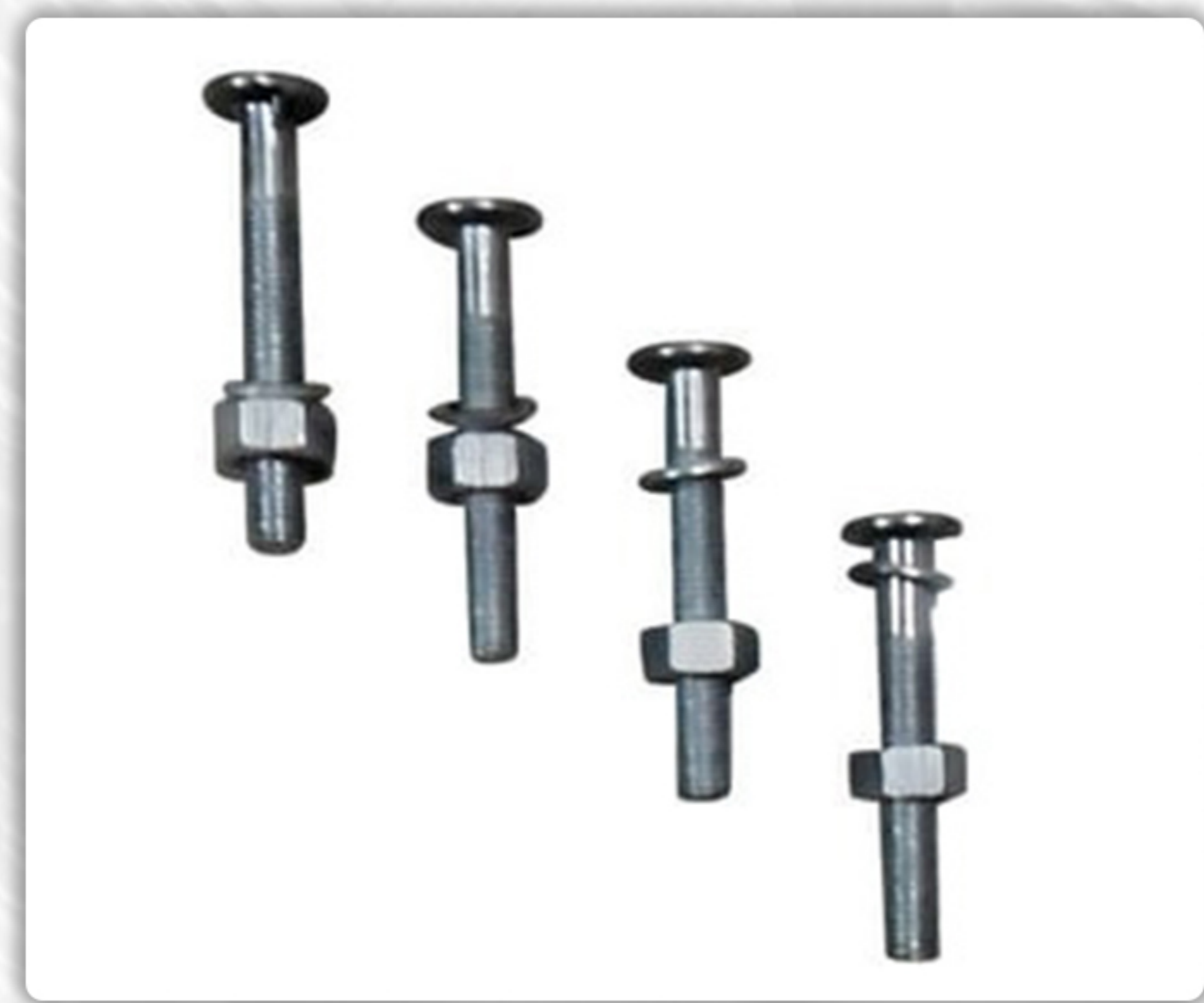
» SEAT PILLAR BOLTS