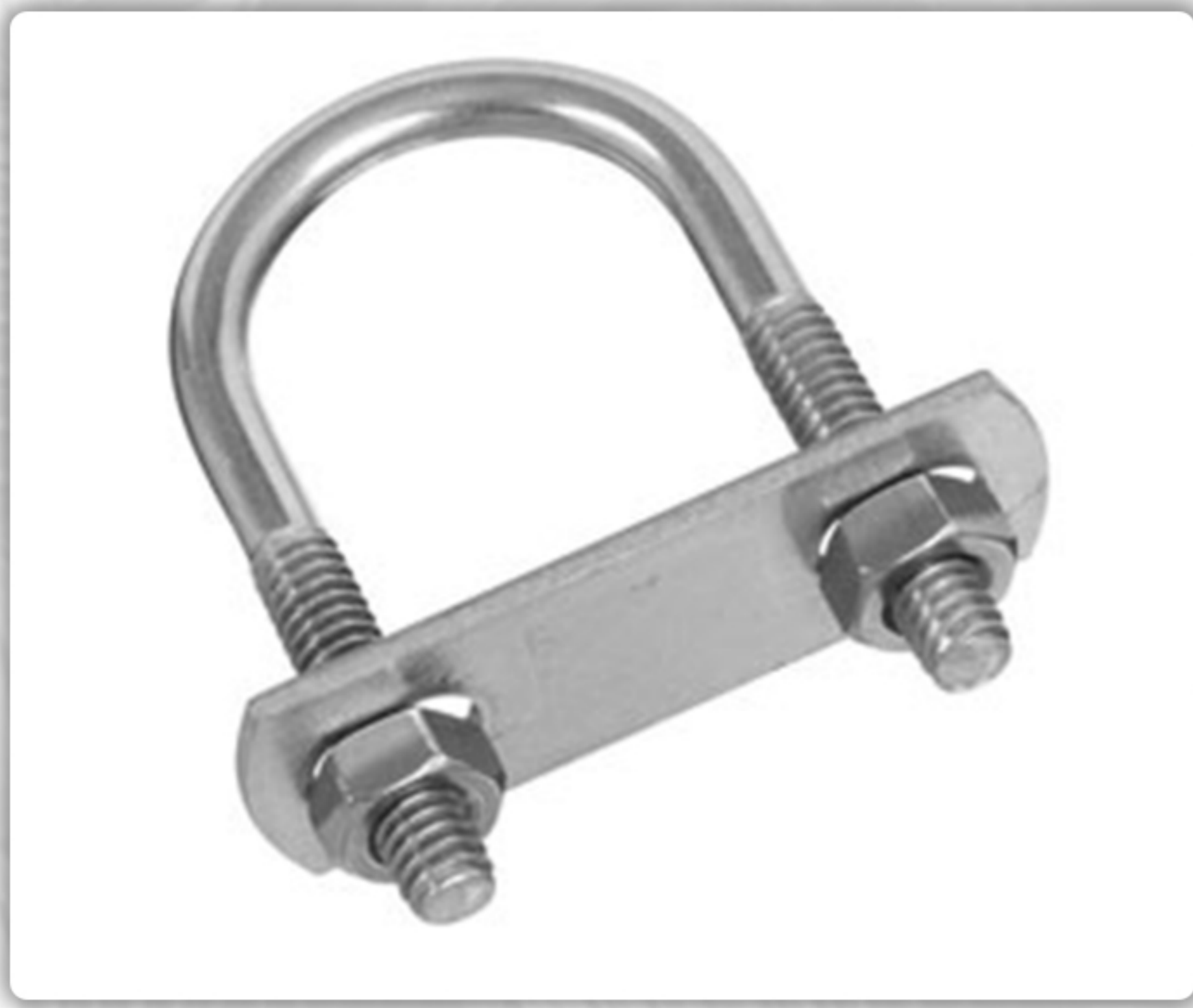
» U BOLTS