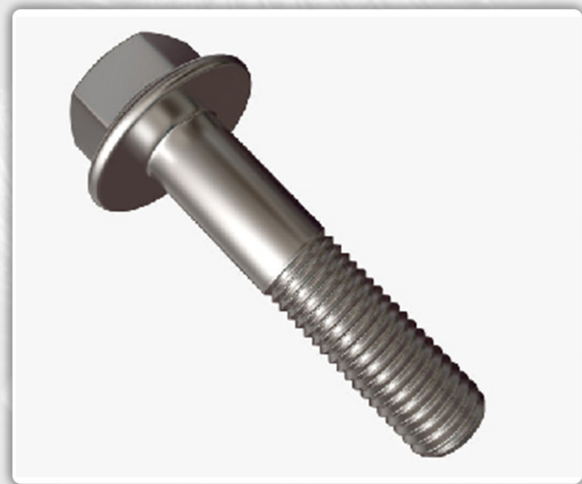
» FLANGE BOLTS HALF THREAD