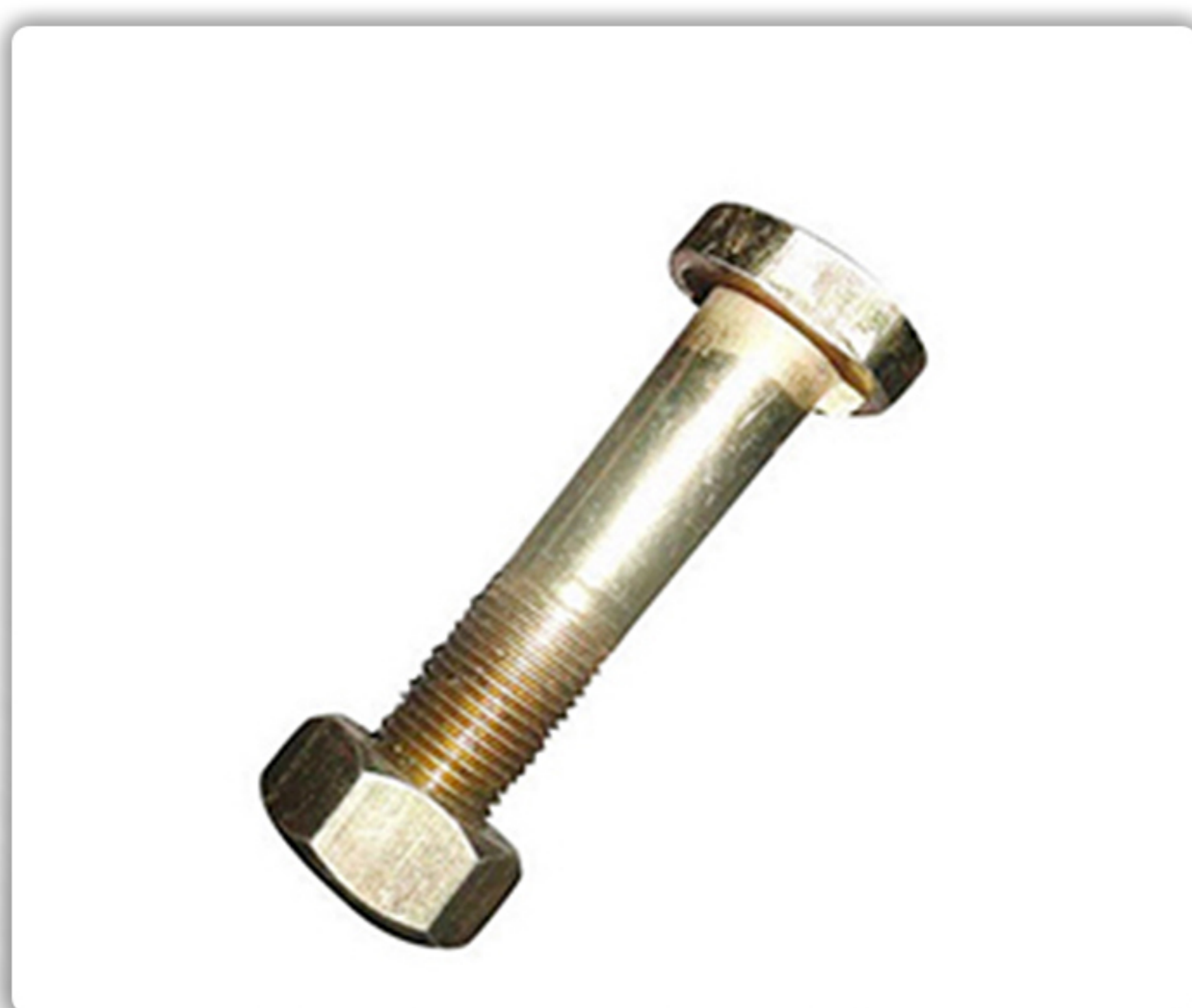
» MAKHI BOLTS