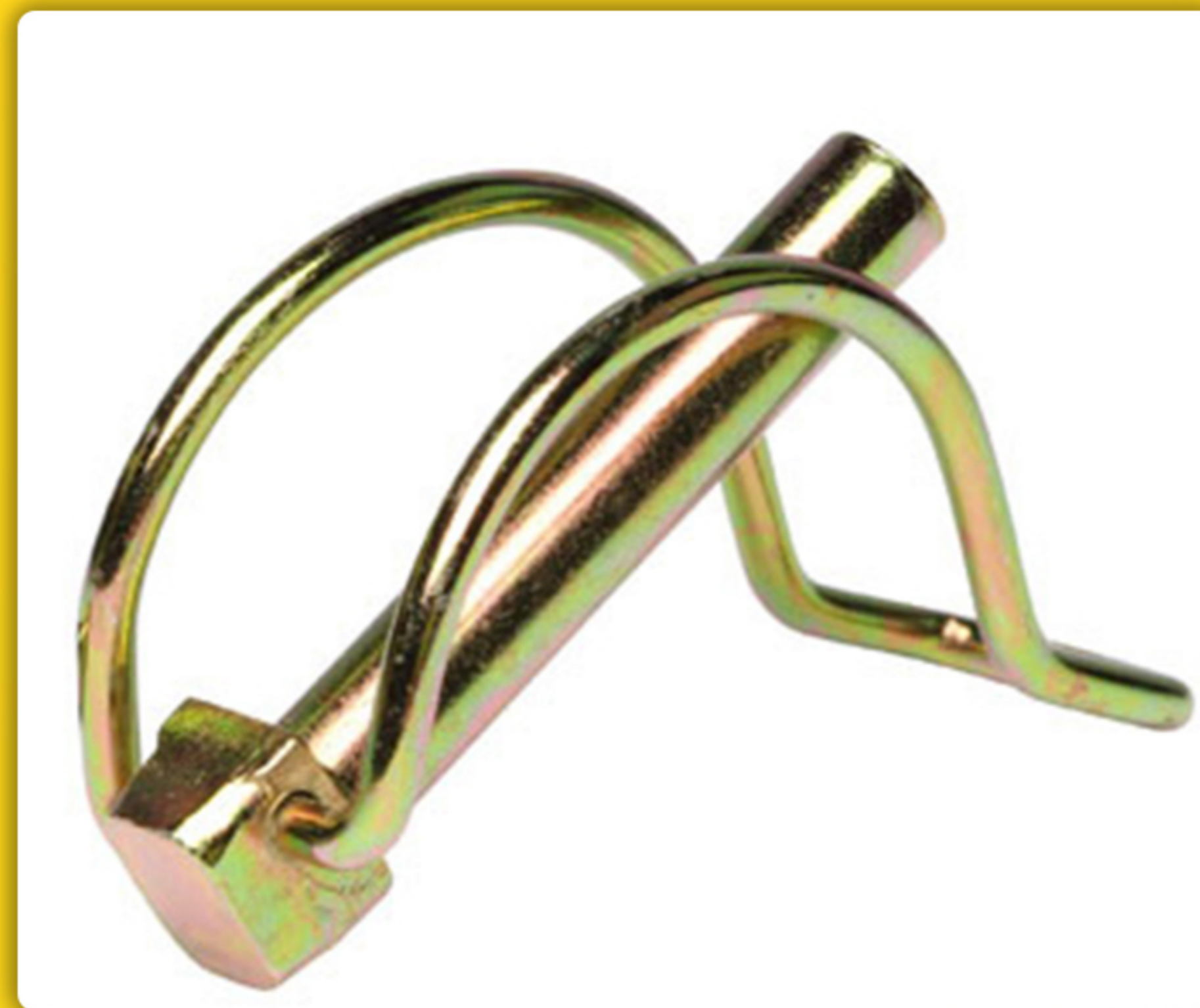
» TUBE PINS