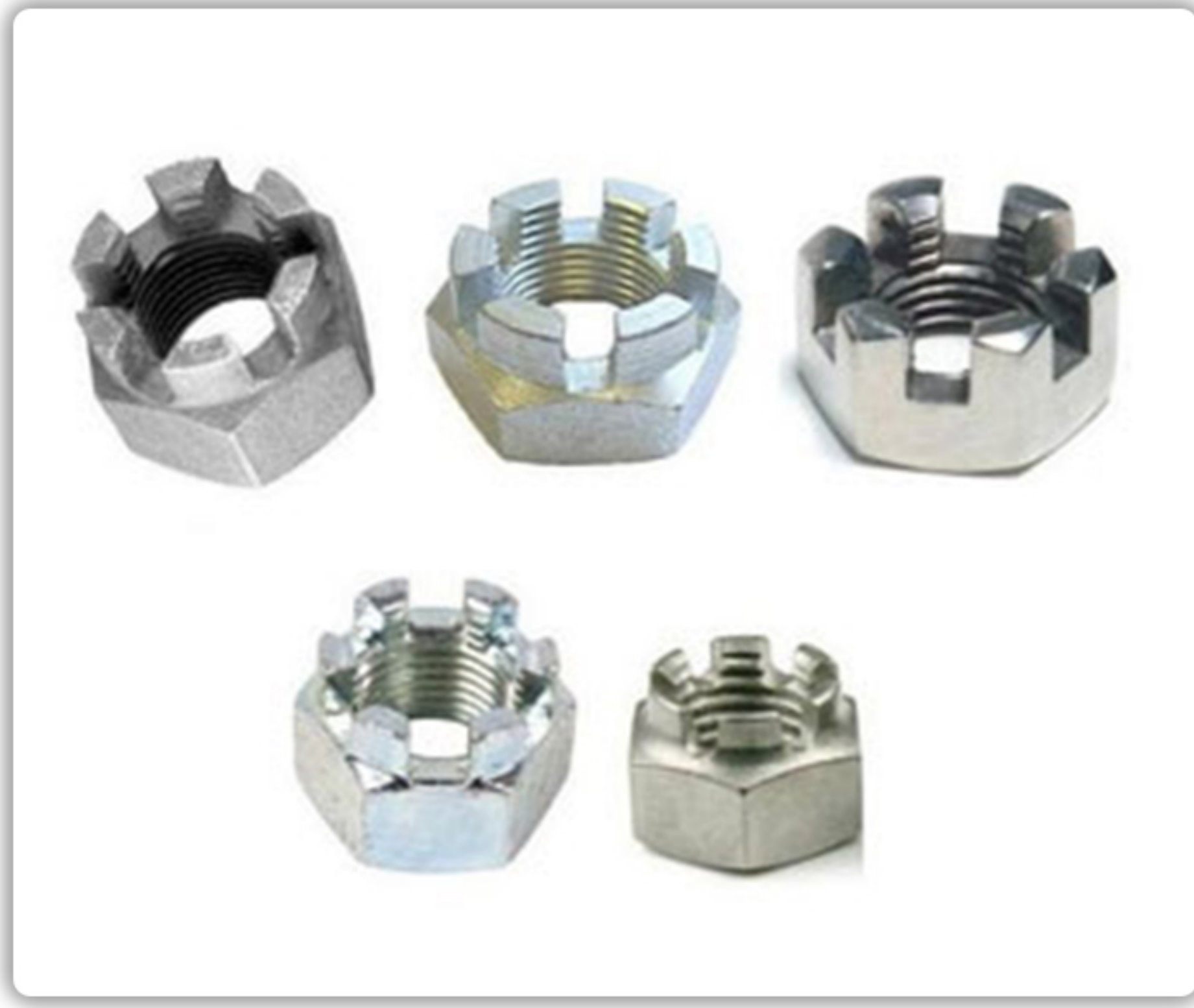
» CASTLE NUTS