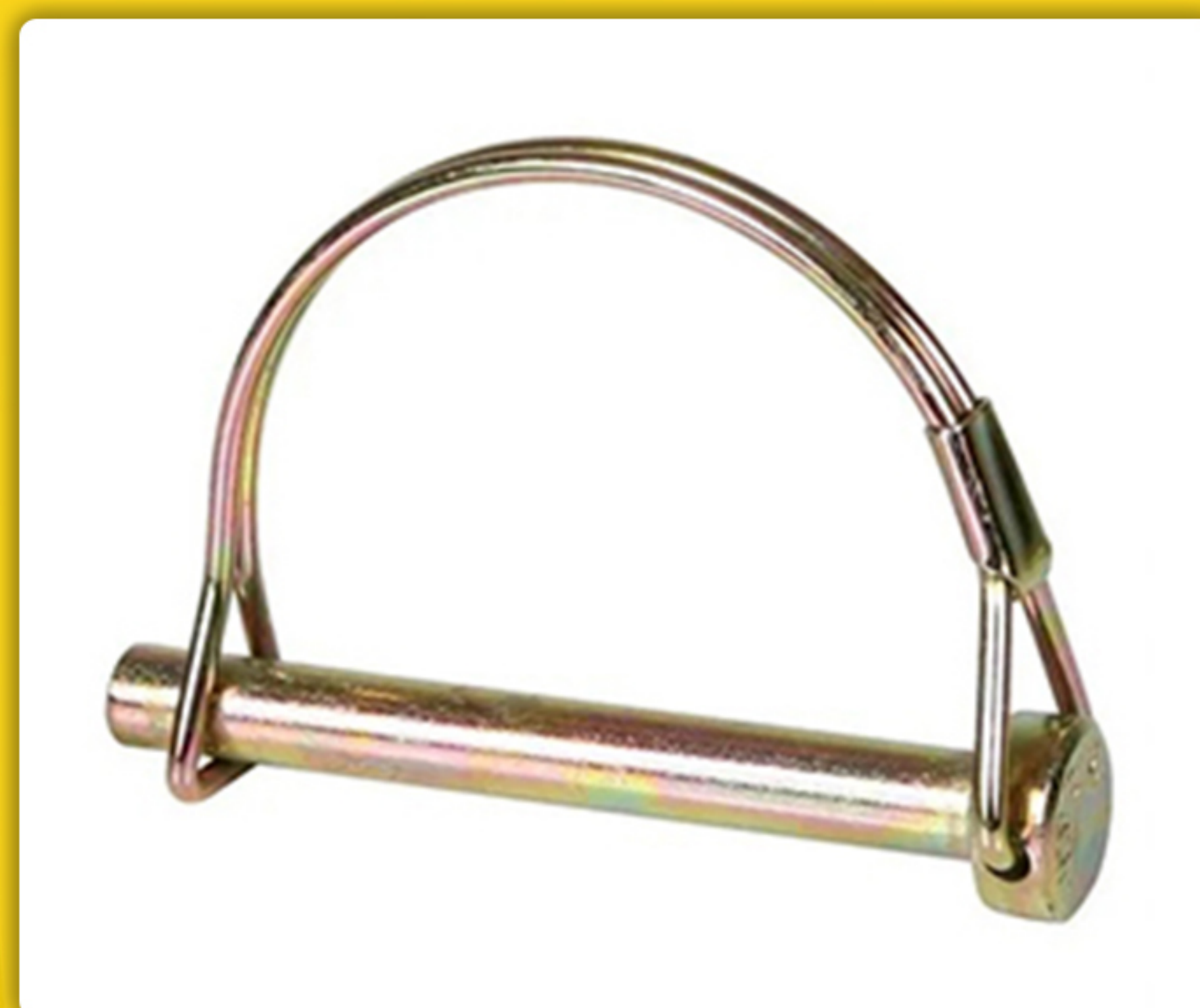
» D SHAPE PTO PINS