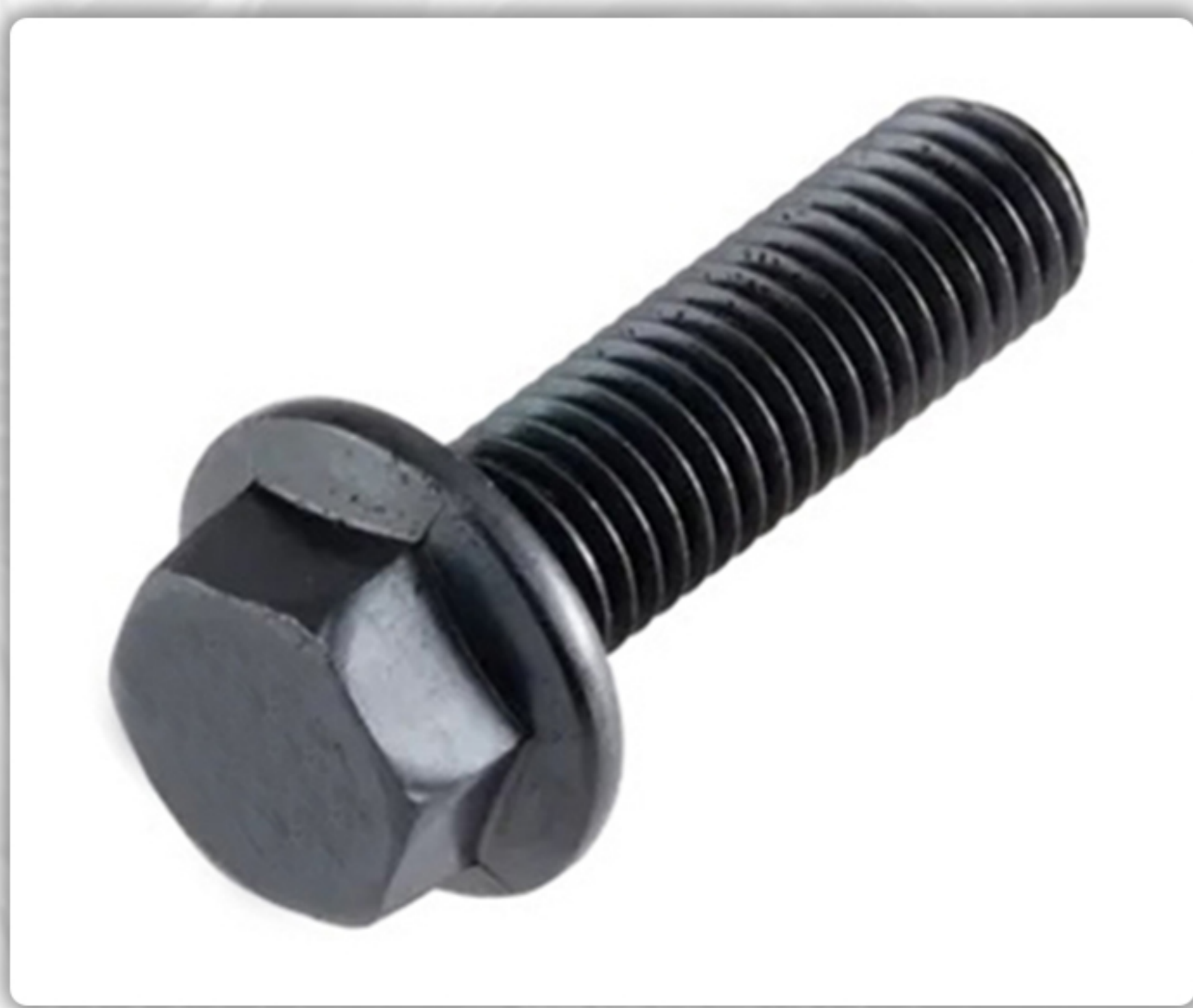
» FLANGE BOLTS FULL THREAD