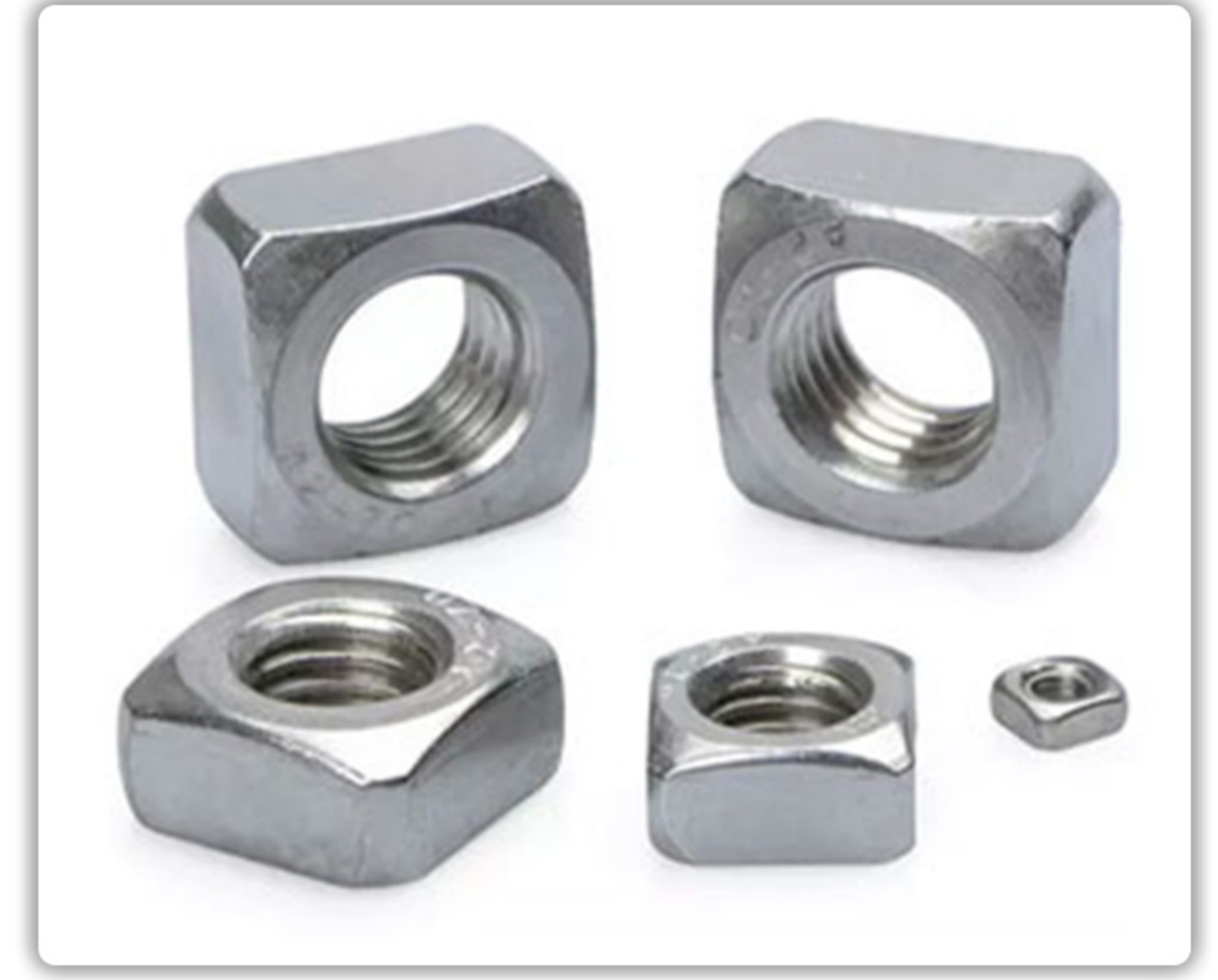
» SQUARE NUTS