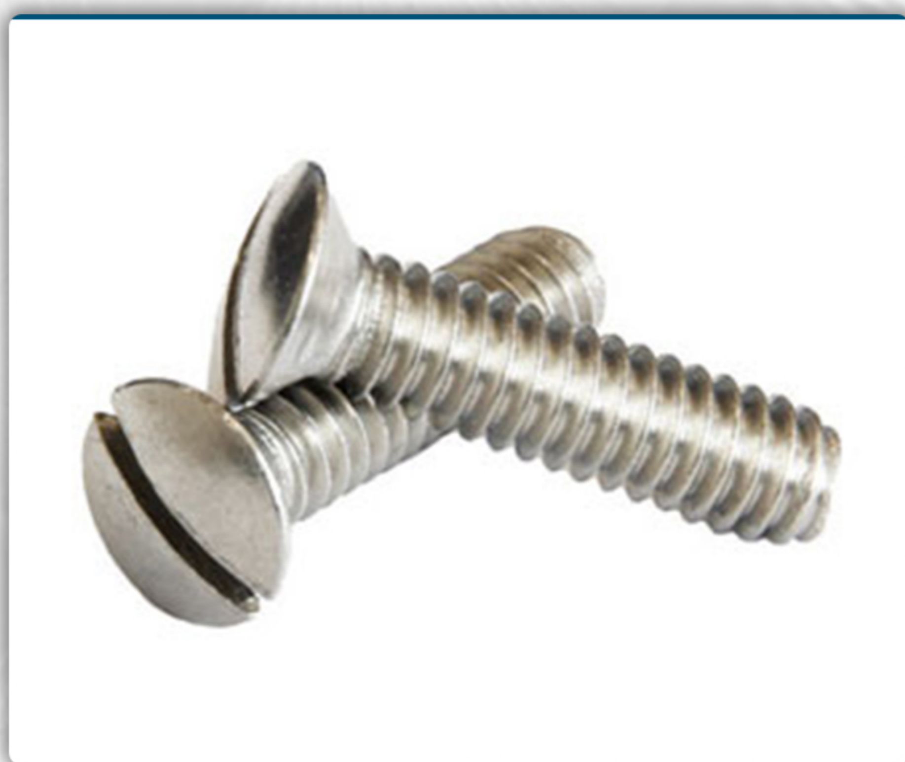
» C.S.K BOLTS