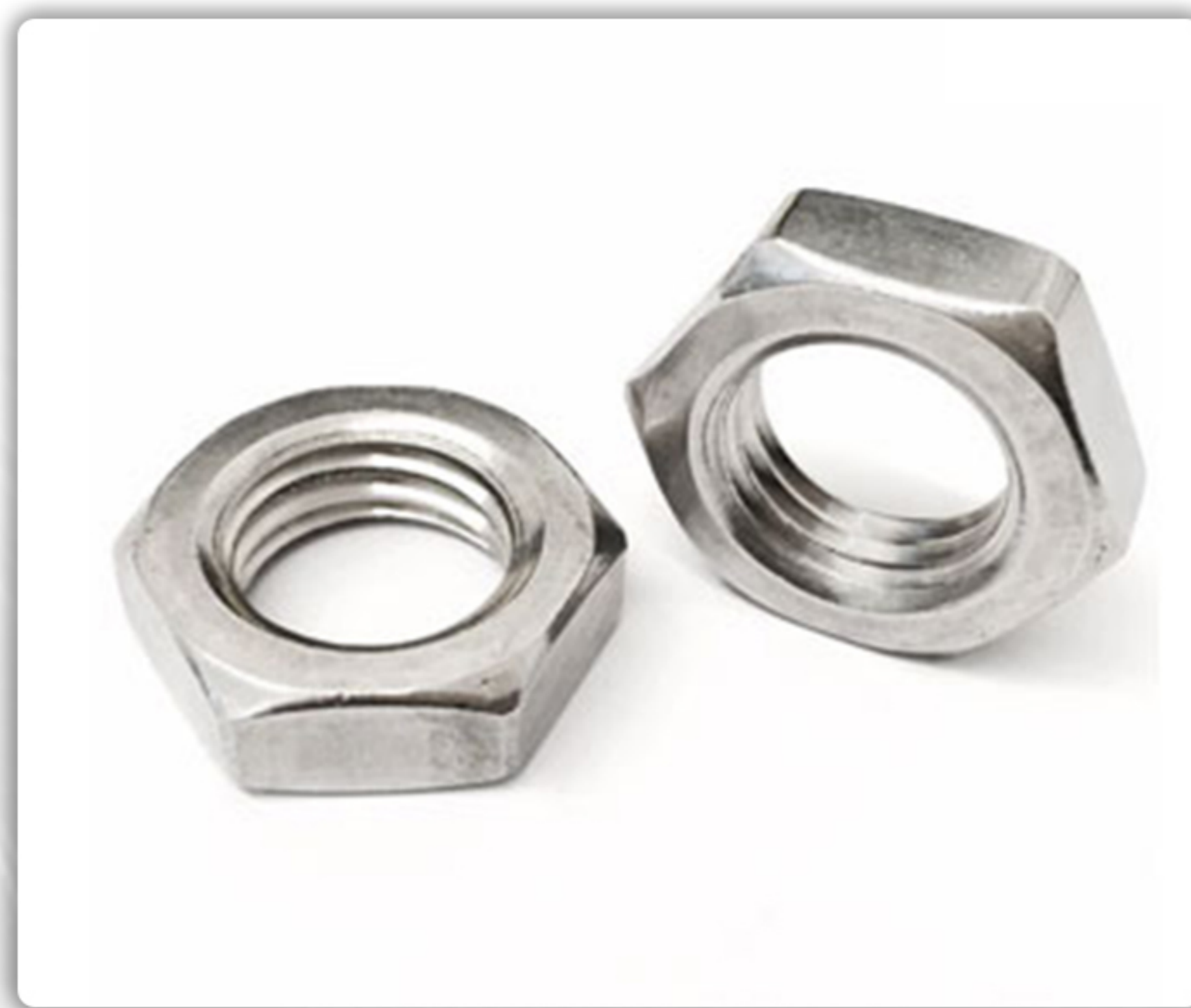
» LOCK NUTS