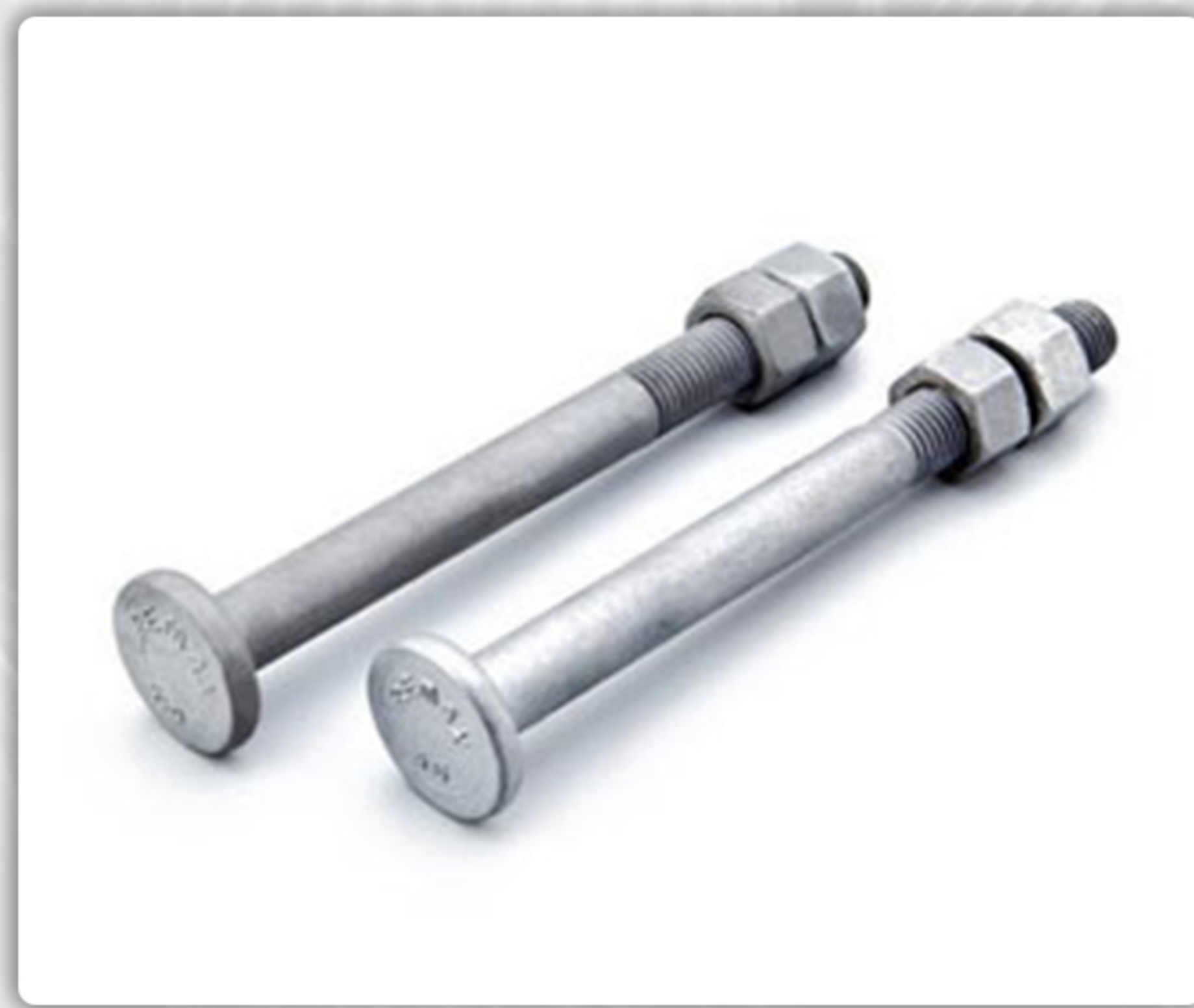
» STEP BOLTS