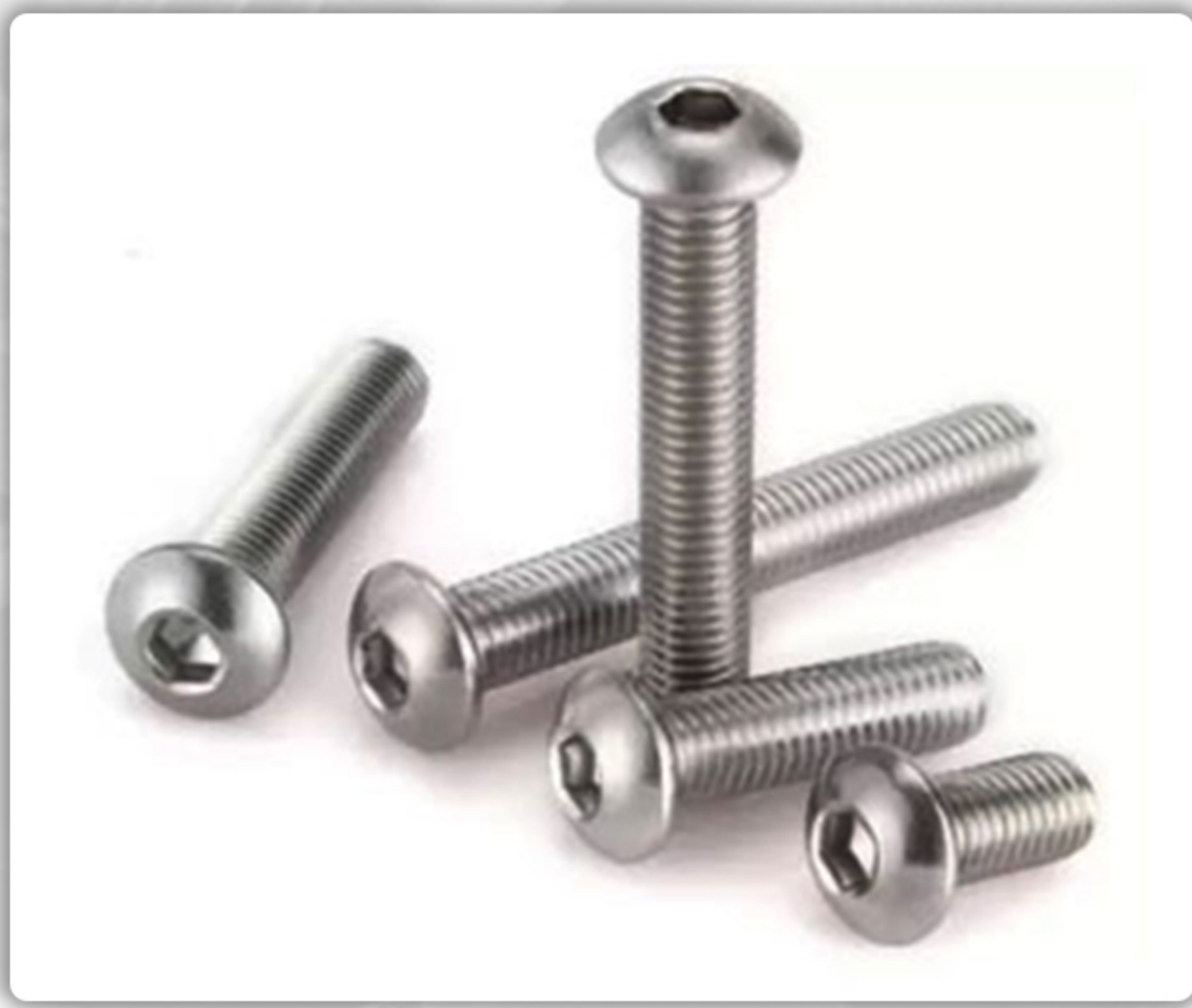
» BUTTON HEAD BOLTS