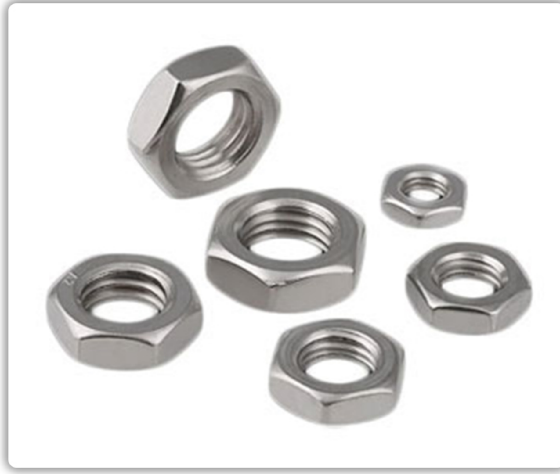
» THIN NUTS