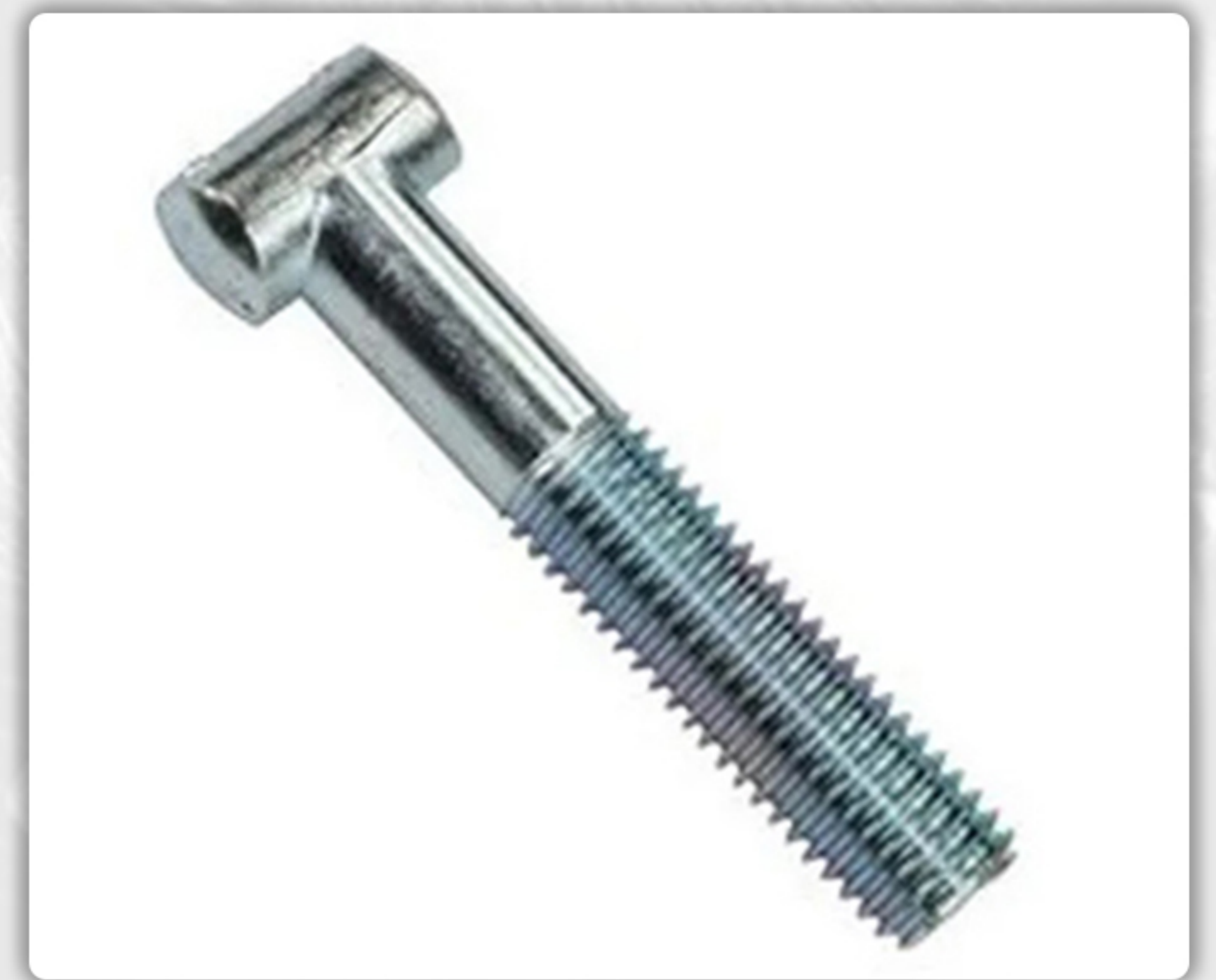
» T BOLTS